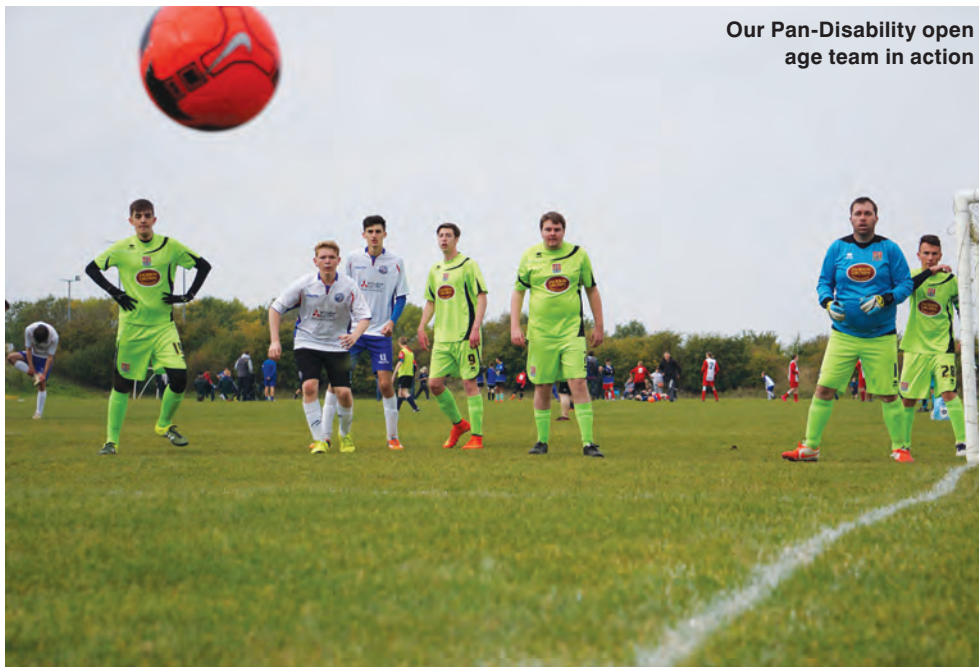
Our Pan-Disability open age team in action