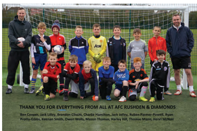
THANK YOU FOR EVERYTHING FROM ALL AT AFC RUSHDEN & DIAMONDS

Let's throw the spotlight on the Under 11s then. I think it's probably right to assume that, had they been in a competitive league, they would have been our second champions of the season as their record this year is phenomenal. Here's how their season ended: