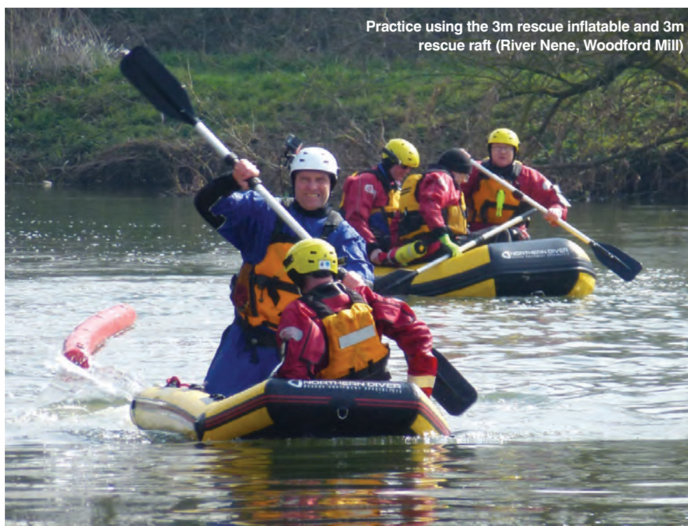
Practice using the 3m rescue inflatable and 3m rescue raft (River Nene, Woodford Mill)

The Rushden Unit of the Maritime Volunteer Service has secured funding of £3,583 for flood/water rescue equipment through their successful bid to the Department for Transport's Inshore and Inland Rescue Boat Grant Scheme for 2015/16.