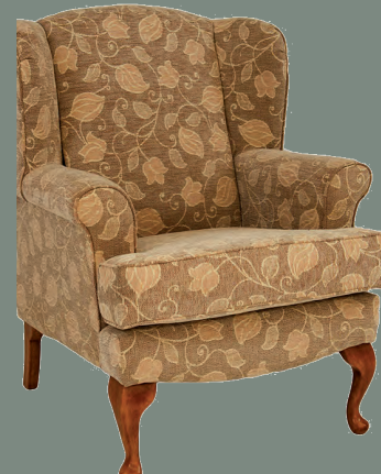
Windsor Armchair £249