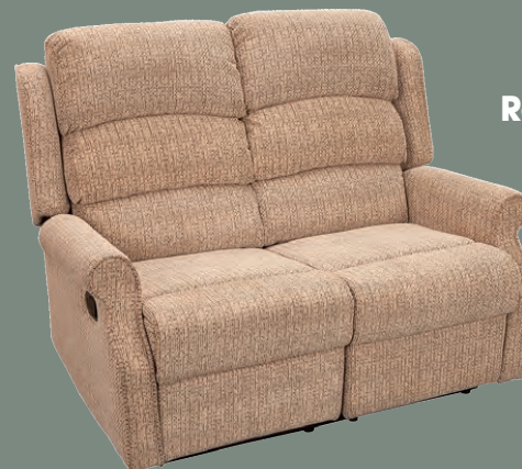
Regent 2 Seater Sofa £549

T: 01536 414121 W: www.thefurniturecentre.com E: sales@thefurniturecentre.com