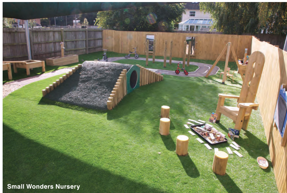
Small Wonders Nursery