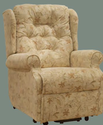
Belvedere Electric Recliner £699