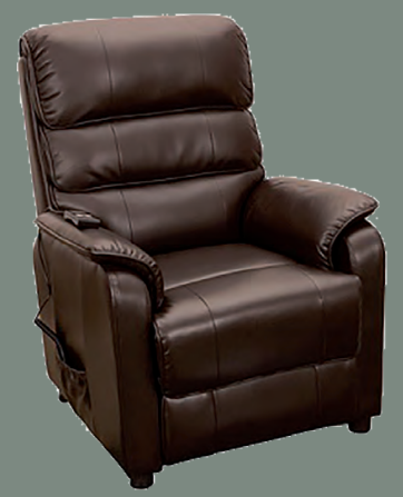
Barclay Recliner Armchair From £299