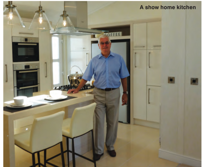
A show home kitchen

With the demand for these exceptional park homes, Prestige Park & Leisure homes are always looking out for skilled craftsman to join the business. They are a family run company with old fashioned values and believe in investing in their employees and