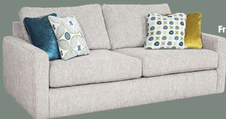
Fraser Collection From £499