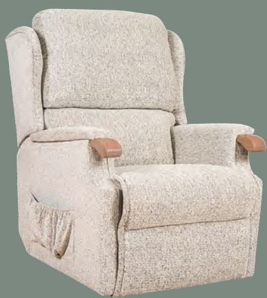
Malvern Electric Recliner £699