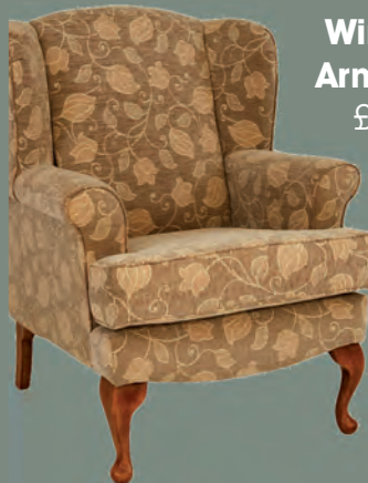
Windsor Armchair £275