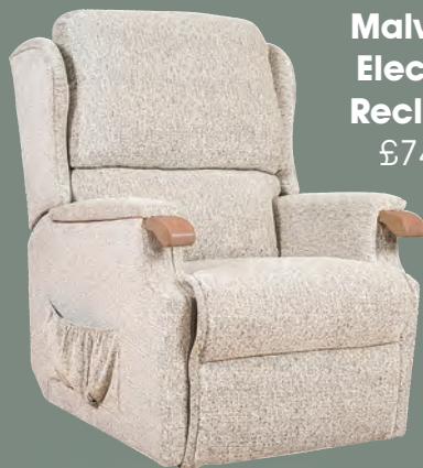
Malvern Electric Recliner £749

Pychley Lodge Industrial Estate, Kettering, NN15 6JQ