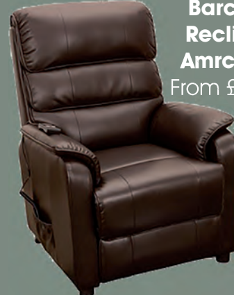
Barclay Recliner Armchair From £369*