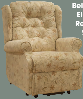
Belvedere Electric Recliner £749