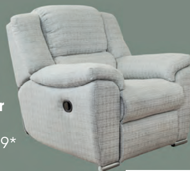
Blake 3 Seater Sofa From £899*

*Recliners available in manual and electric