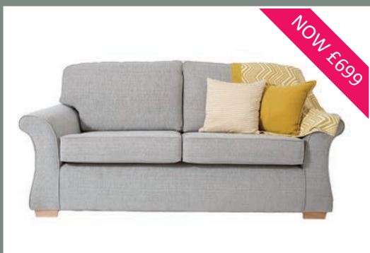
Normandy 3 Seater Sofa & Chair