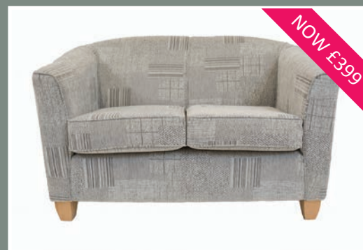
Tub 2 Seater Sofa & Chair