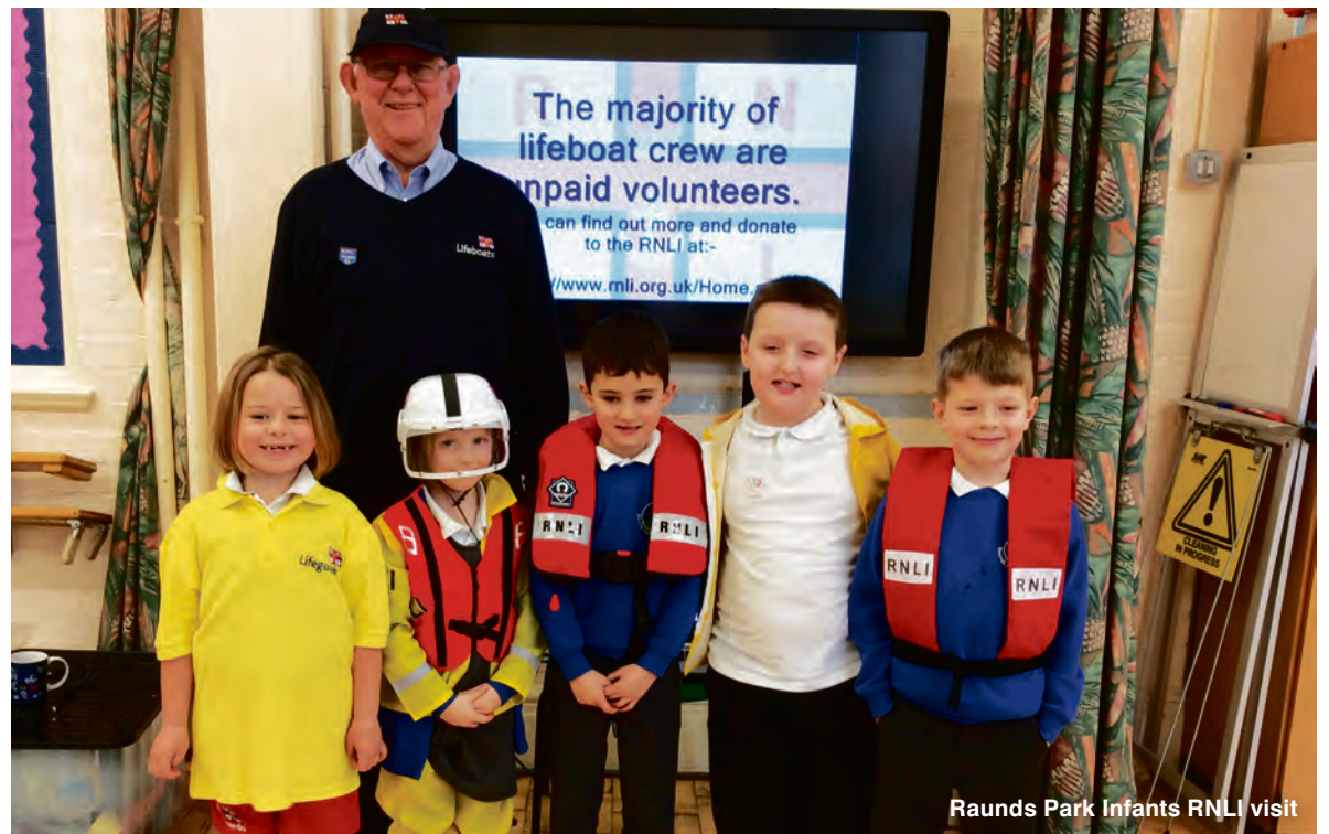
Raunds Park Infants RNLI visit