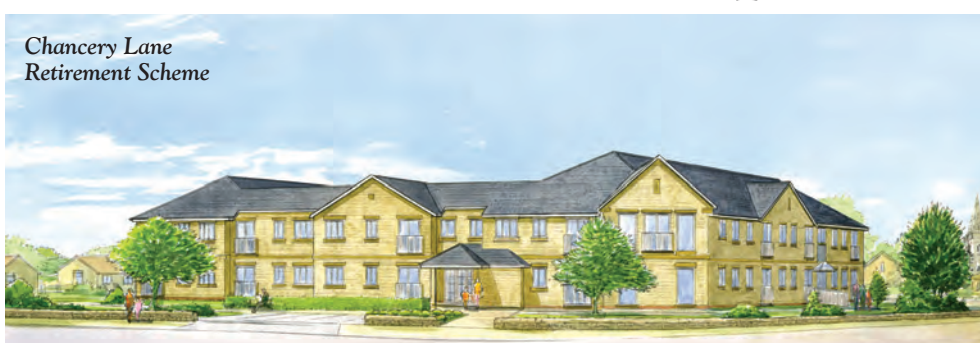
Chancery Lane Retirement Scheme

To register your interest in the scheme, or for more information about purchase options, please contact Millers New Homes on 01604 638000.