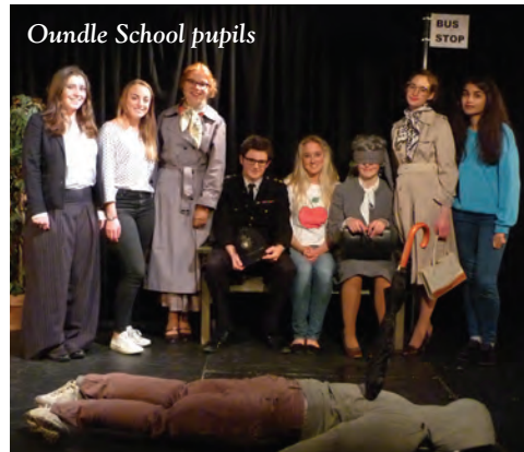
Oundle School pupils