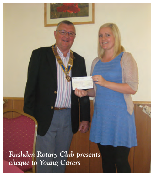
Rushden Rotary Club presents cheque to Young Carers