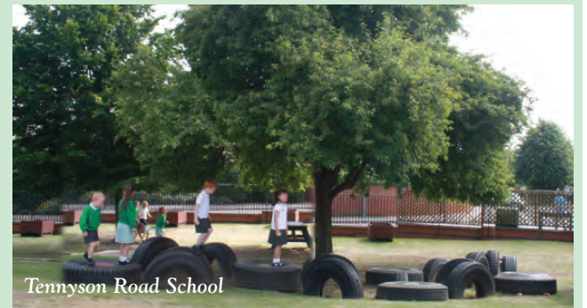
Tennyson Road School

Tel 01933 314161 or visit www.tennysonrd.org.uk