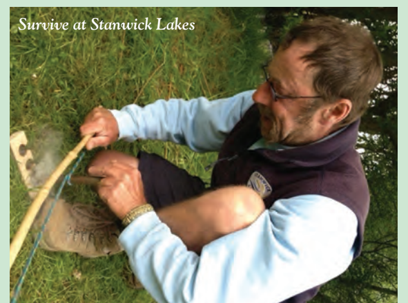
Survive at Stanwick Lakes