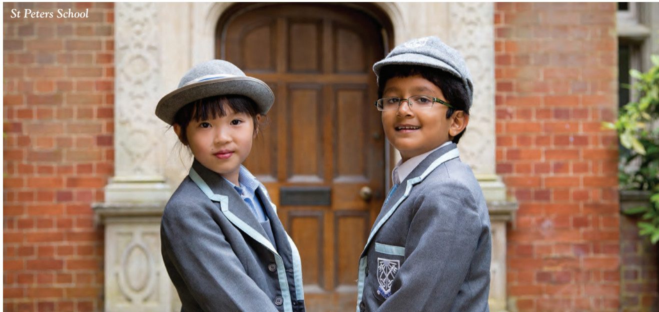
St Peters School

An Independent Day School in Kettering, where children up to age 11 are encouraged to develop to their full potential.