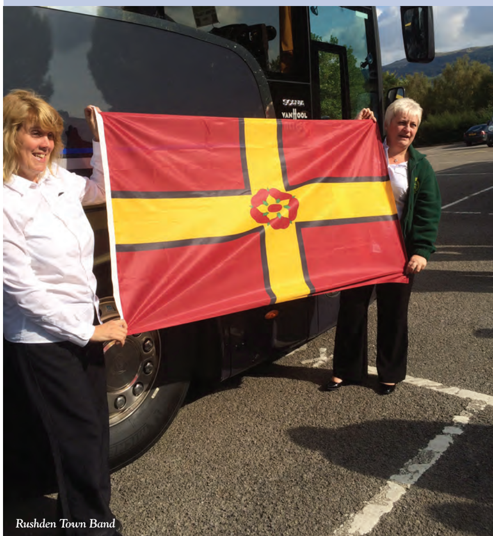
Rushden Town Band

In addition to competitions such as this, the band plays at concerts, fetes and, with Christmas coming up, will be extremely busy in the coming months. If you are interested in finding out more about the band, please contact Sal Kneale on 01933 665420.