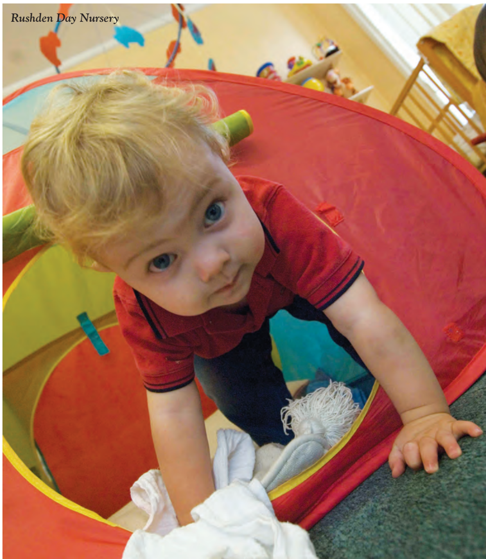
Rushden Day Nursery

At Rushden Day Nursery we look after children from six weeks to five years and have key rooms dedicated to helping them develop at their own pace. Our new baby room is for babies from six weeks to two years and includes a sensory den and ball pool to provide a stimulating environment to enhance their experience. We also offer packages to include nappies, wipes and formula, making life much easier for our busy parents. All food in the nursery is homemade and locally sourced. Please call 01933 418309 to arrange a visit.