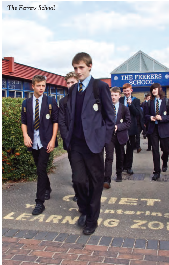
The Ferrers School