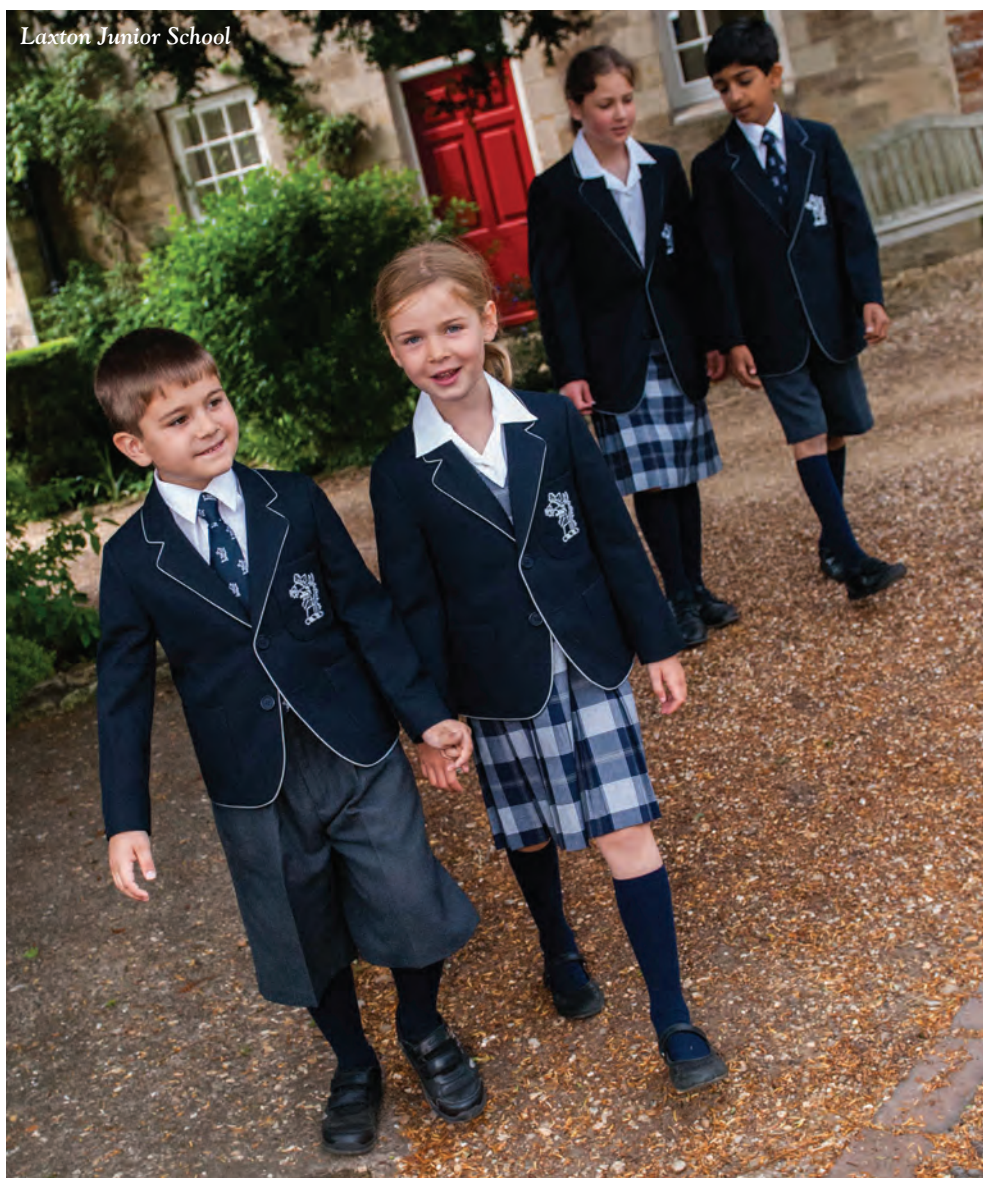
Laxton Junior School