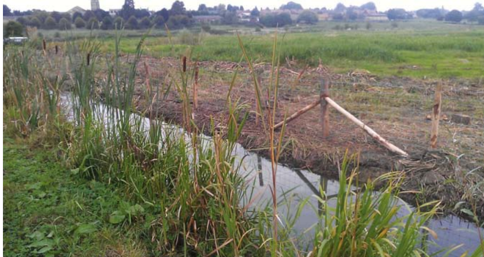
New fencing at Irthlingborough Lakes and Meadows ready for cattle grazing