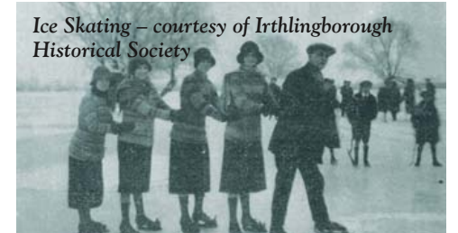
Ice Skating