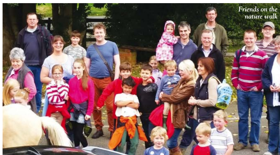
Friends on the nature walk

With the final decision about the move to the two tier system being made in November, Glapthorn School is preparing to make the possible change from a position of strength, with exciting plans for additional new facilities.