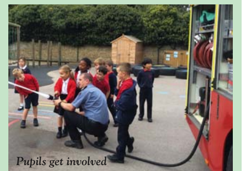
Pupils get involved

The school's Year 2 pupils were learning about jobs and police and fire officers were on hand to answer questions about what their role within the local community involves.