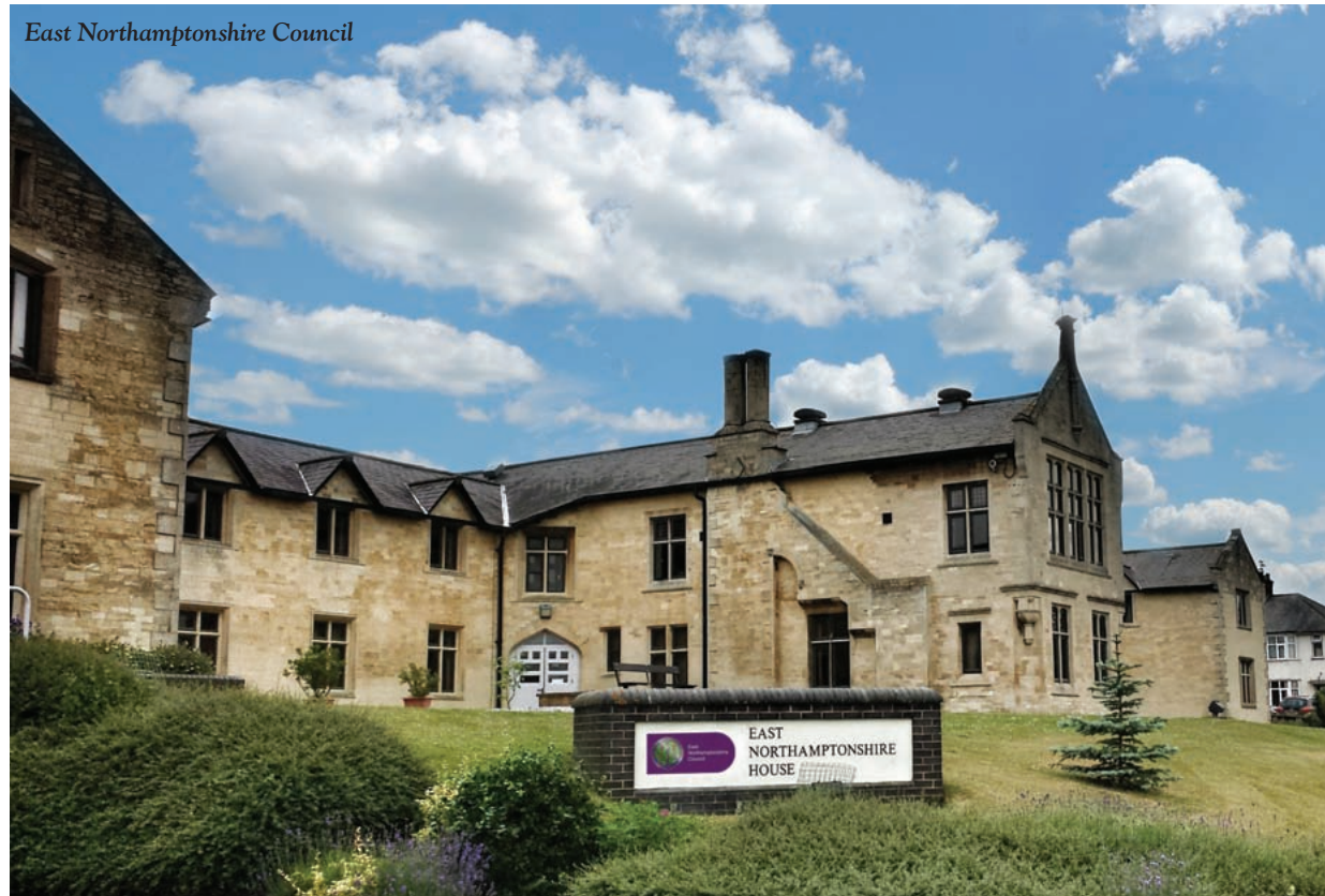
East Northamptonshire Council

currently has housing land supply for 3,865 dwellings, which equates to nine years' worth. Given that the council is easily able to demonstrate a robust five-year housing land supply, the Inspector concluded that the scheme's