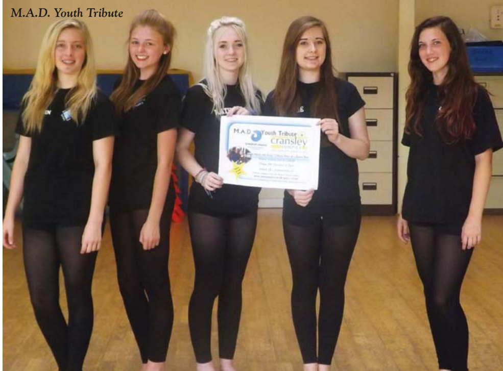
M.A.D. Youth Tribute

If you can't attend but still want to donate, visit these JustGiving pages http://justgiving.com/madyouthtribute http://justgiving.com/madyouthtribute2