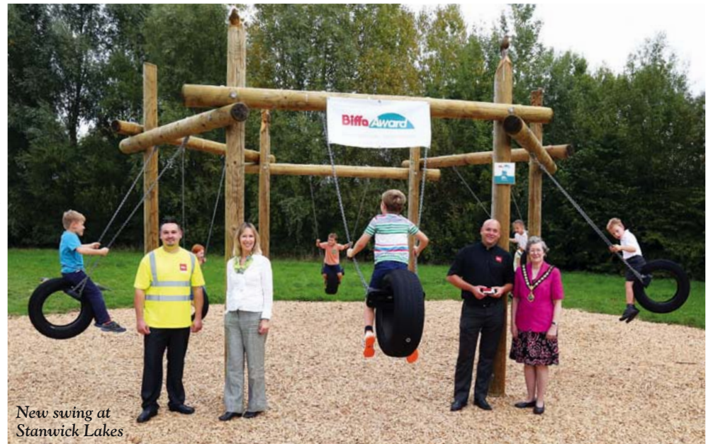
New swing at Stanwick Lakes

Trail, try out the swing and clamber over the giant wooden ladybird or snake!