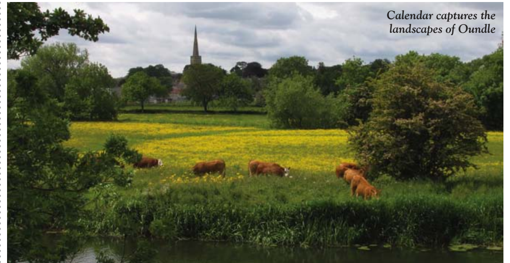
Calendar captures the landscapes of Oundle

The Friends of Oundle Library recently held a party to celebrate the launch of their third Scenes Around Oundle calendar, which each year raises money to improve the facilities at Oundle Library.