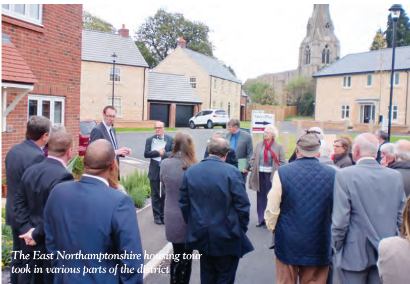
The East Northamptonshire housing tour took in various parts of the district

To find out more about housing, visit www.east-northamptonshire.gov.uk/housing or call 01832 742000.