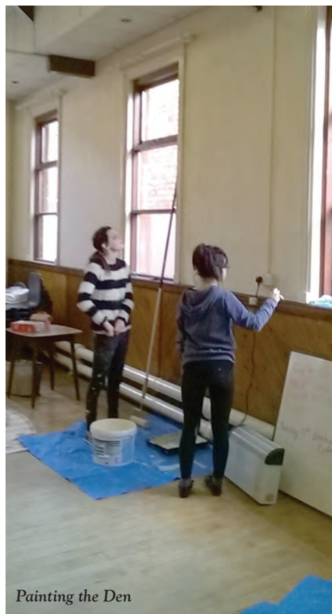
Painting the Den