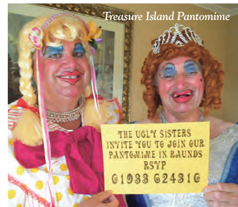
The Kings Arms