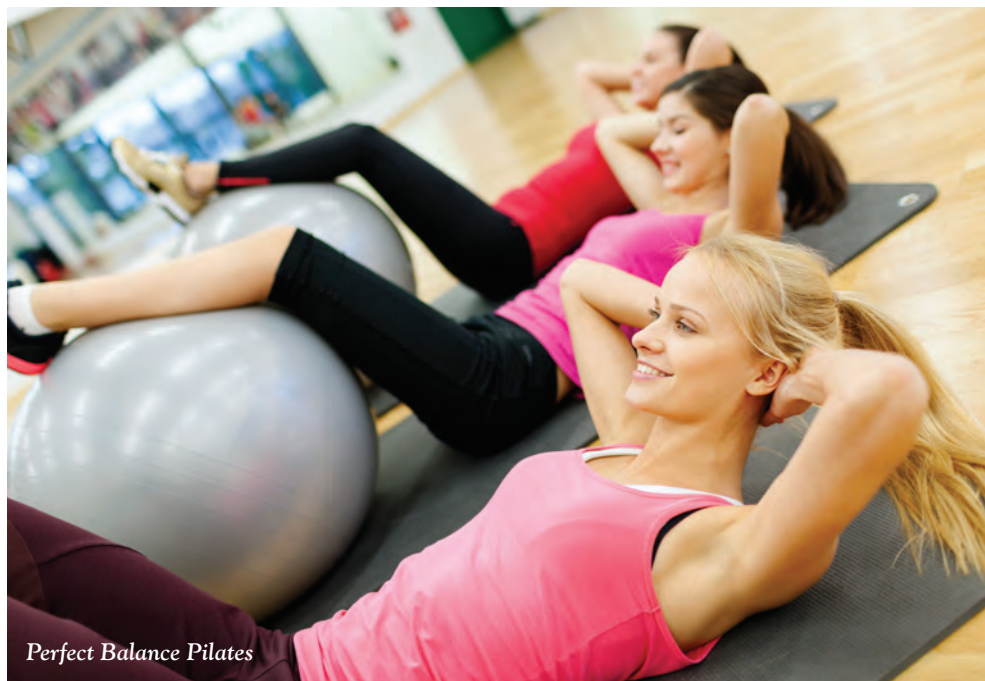
Perfect Balance Pilates

For info call 07525 816911 or email manorfitness@hotmail.co.uk