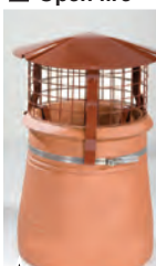
Bird guards & chimney stacks