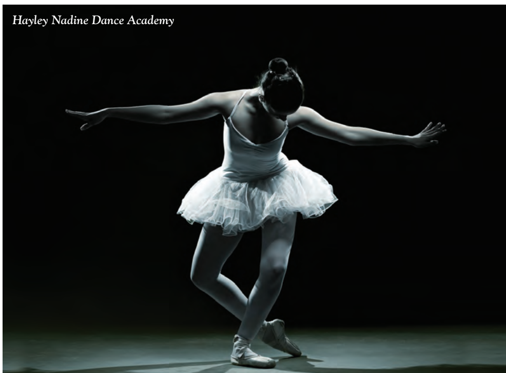
Hayley Nadine Dance Academy

Ideal for anyone and everyone, the classes are yoga based and incorporate elements of Tai Chi and Pilates to leave you feeling calm and centred. Whilst you bend, stretch and strengthen you will be inspired by the beautiful soundtrack. Don't worry if you are new to yoga as options are given throughout the class. See advert for more details.