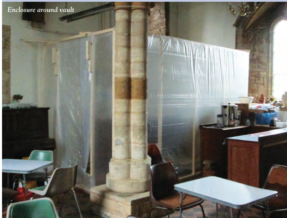
Enclosure around vault

The opened vault was cordoned off and work stopped until approval was given by the diocese to continue.