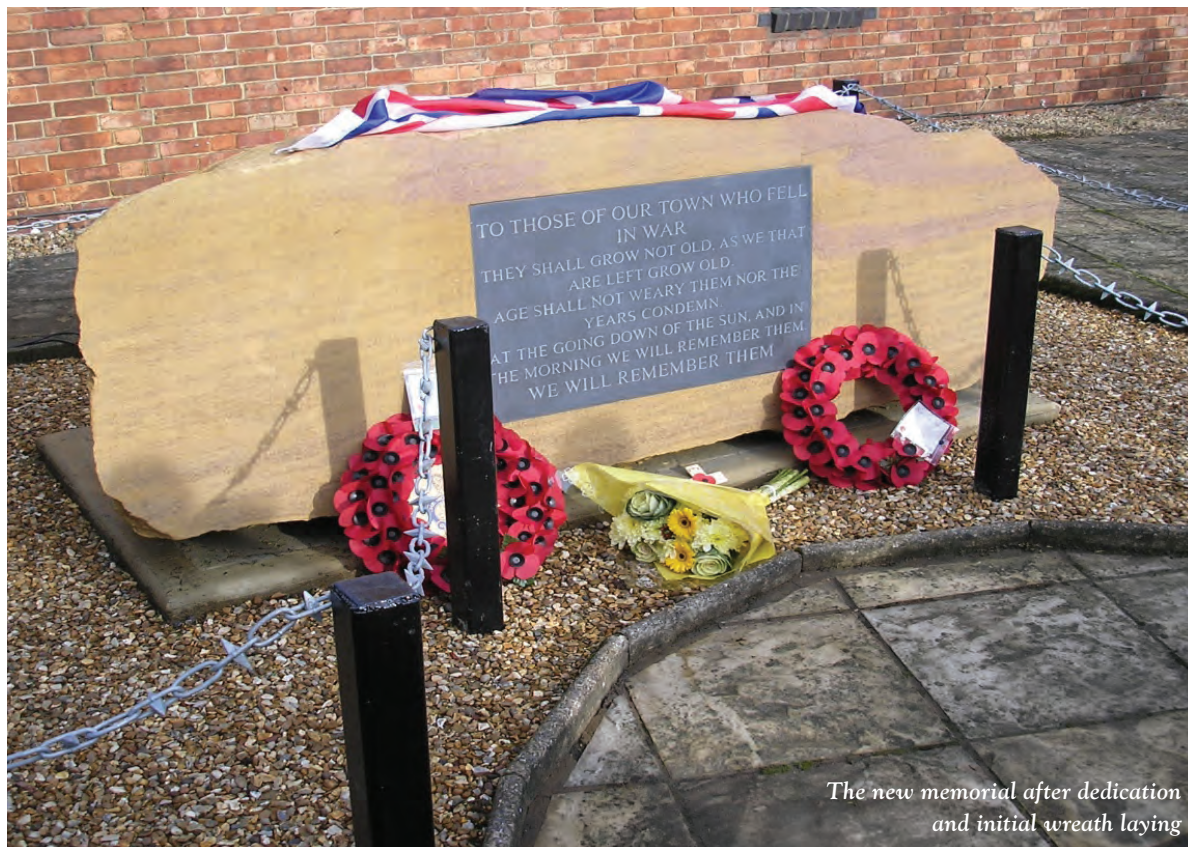
The new memorial after dedication and initial wreath laying