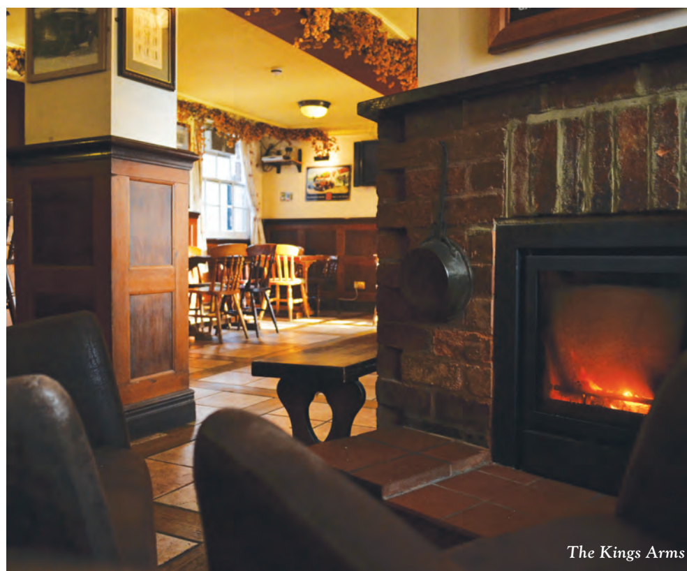
The Kings Arms

Throughout December homemade food will be served throughout the pub. Some Christmas party spaces are still available. With real ales, log burners, a chic intimate restaurant and live sport, there is something for everyone at The Kings Arms.