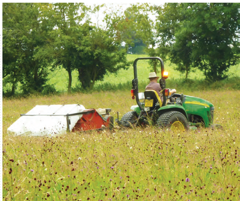
Harvesting wildflower seeds from the stunning Boddington Meadow Wildlife Trust Nature Reserve, to be used to create new meadows in the Nene Valley