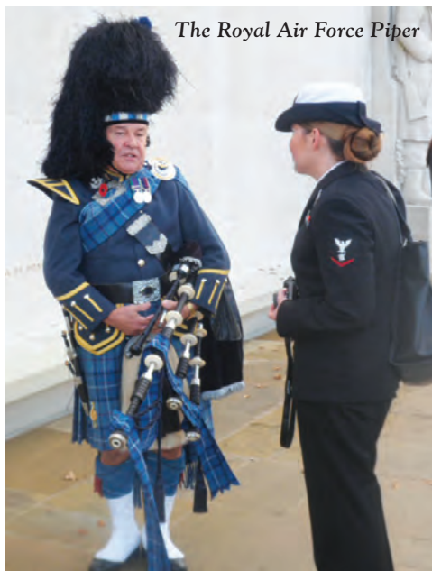
The Royal Air Force Piper

The American Cemetery was dedicated in 1956 and is the final resting place of 3,812 American servicemen and women.