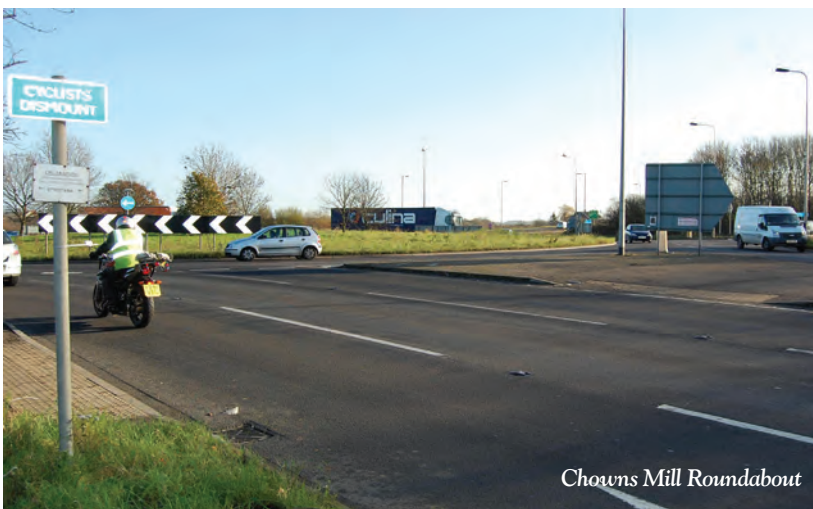
Chowns Mill Roundabout