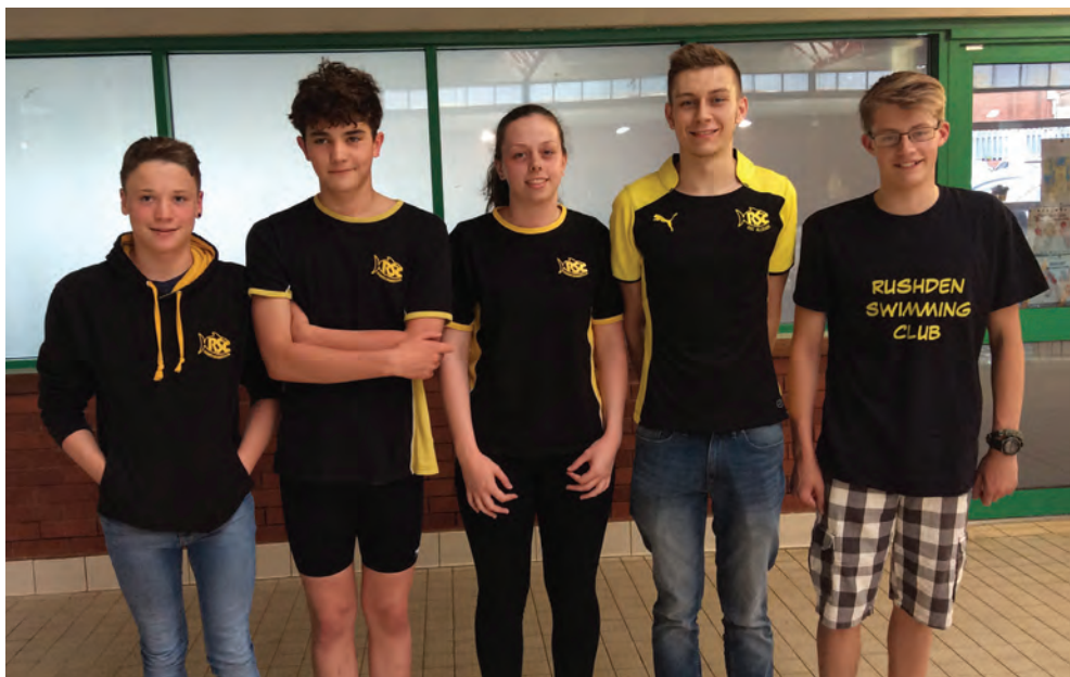
Pictured above and top: The women's relay team and other regional qualifiers