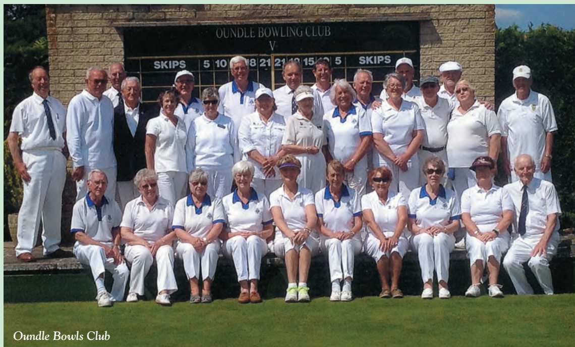
Oundle Bowls Club

On 24th June members of Oundle Bowls Club hosted a Florida Mixed Bowls team. The match was played on five rinks and after a very competitive and friendly game, Oundle were very narrow winners by seven shots overall.