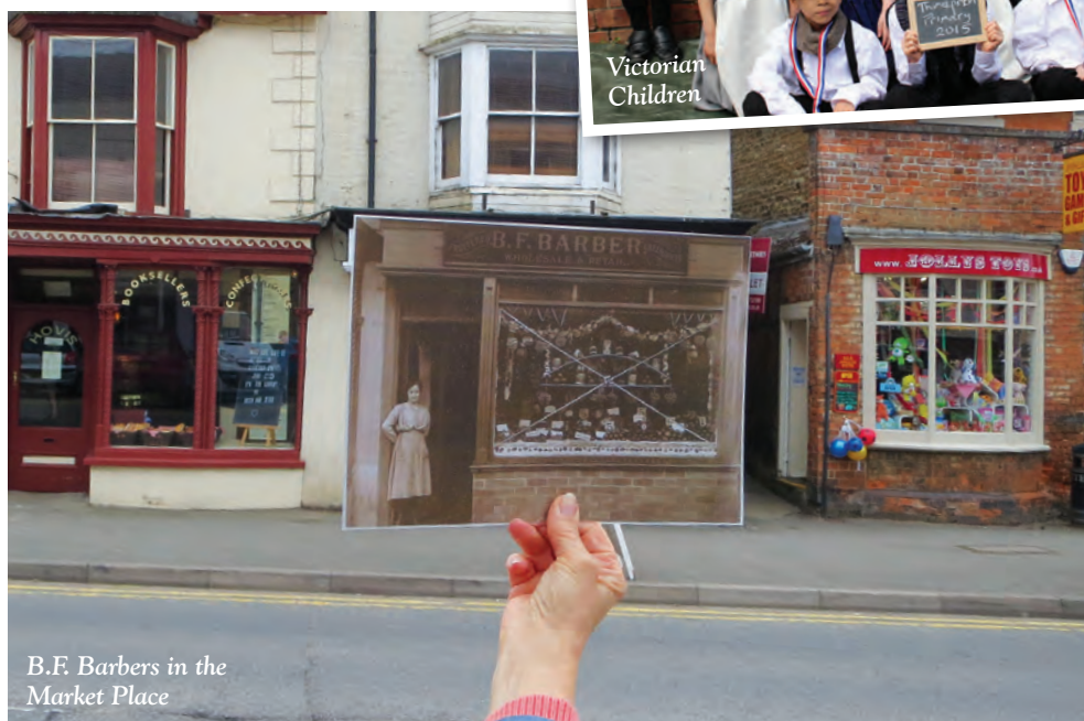
B.F. Barbers in the Market Place

We want to hear from you, so please submit your news story or event at www.nenevalleynews.co.uk