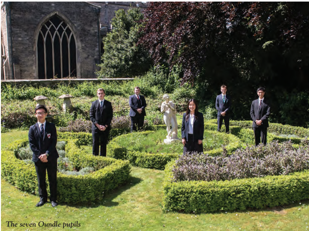
The seven Oundle pupils