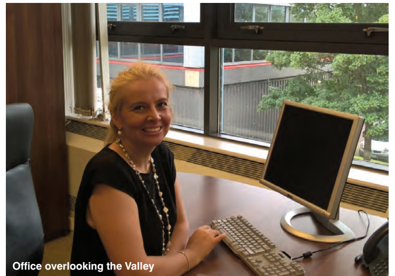
Office overlooking the Valley

So if you are looking for great office space with modern facilities conveniently located alongside the A45/A6 junction with ample free parking, I would definitely recommend the Nene Business Centre. Visit and look around, you will be made to feel welcome and I guarantee you will discover a great location for your business to thrive in. Their website is