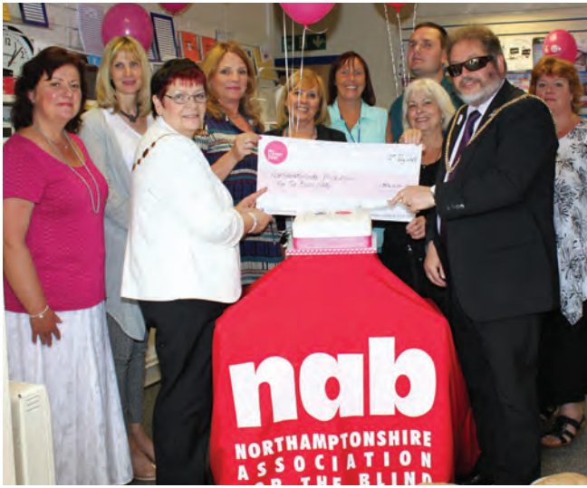
For more information on funding available visit: https://www.biglotteryfund.org.uk/funding . To find out more about services provided by Northamptonshire Association for the Blind please call their Helpline: 01604 719193 or visit www.nab.org.uk

improved their lives." Today's awards have been made through the BIG Lottery Fund's Awards for All and Reaching Communities programmes. Awards for All provides grants between £300 and £10,000 to voluntary and community organisations and Reaching Communities awards larger grants of £10,000 and above.