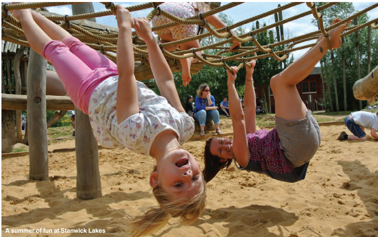
A summer of fun at Stanwick Lakes

And if your family prefer singing, dancing and musical fun, join Immersion Theatre for their adaptation of The Wizard of Oz in the outdoor theatre at Stanwick Lakes. With a stellar cast who have starred in the West End, UK and international touring productions, it's not to be missed! The show has lashings of audience participation, dazzling costumes, an original script and plenty of laughter, and will have you shouting, clapping and singing along to the music. The Wizard of Oz will be performed at 4.30pm on Wednesday 17th August, with a pre-show workshop available for 5-11 year olds at 3pm. Book your tickets at www.seetickets.com .