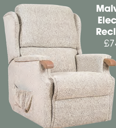
Malvern Electric Recliner £749

Pytchley Lodge Industrial Estate, Kettering, NN15 6JQ