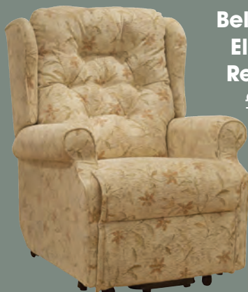
Belvedere Electric Recliner £749