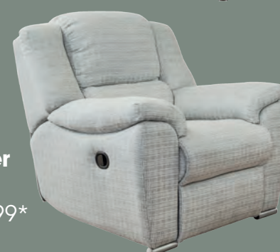
Blake 3 Seater Sofa From £899*

*Recliners available in manual and electric