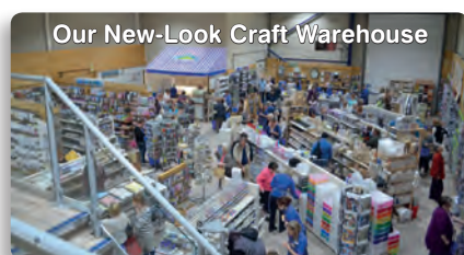
Our New-Look Craft Warehouse