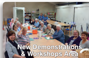
New Demonstrations & Workshops Area

Colemans Craft Warehouse has re-opened, completely re-furbished with a new mezzanine floor for Workshops & Demonstrations, a brand new Café area & wonderful new displays to show off all your favourite craft & haberdashery supplies! Also, we now OPEN 6 DAYS A WEEK!