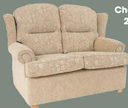
Cheltenham 2 Seater Sofa £499