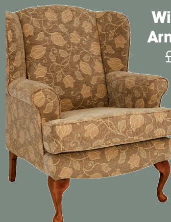
Windsor Armchair £275