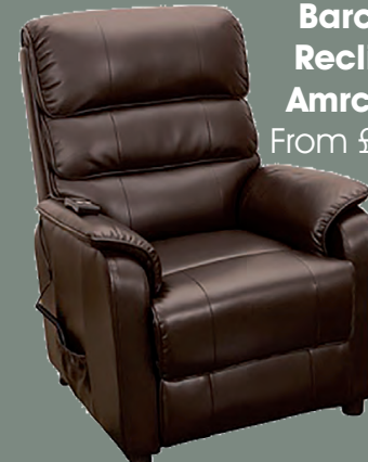
Barclay Recliner Armchair From £369*