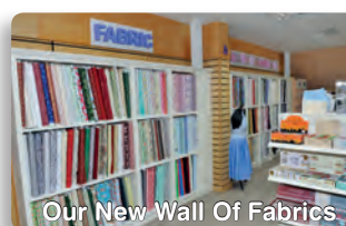
Our New Wall Of Fabrics