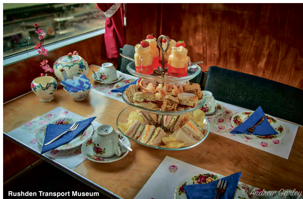
Rushden Transport Museum

When you visit Rushden Transport Museum don't forget to visit our 1930s restored Gresley Buffet Carriage situated at the far end of the site, just beyond the signal box. We are open on event days offering hot and cold drinks plus sandwiches and rolls made to order. We are especially well known for our delicious homemade cakes and scones. Vintage