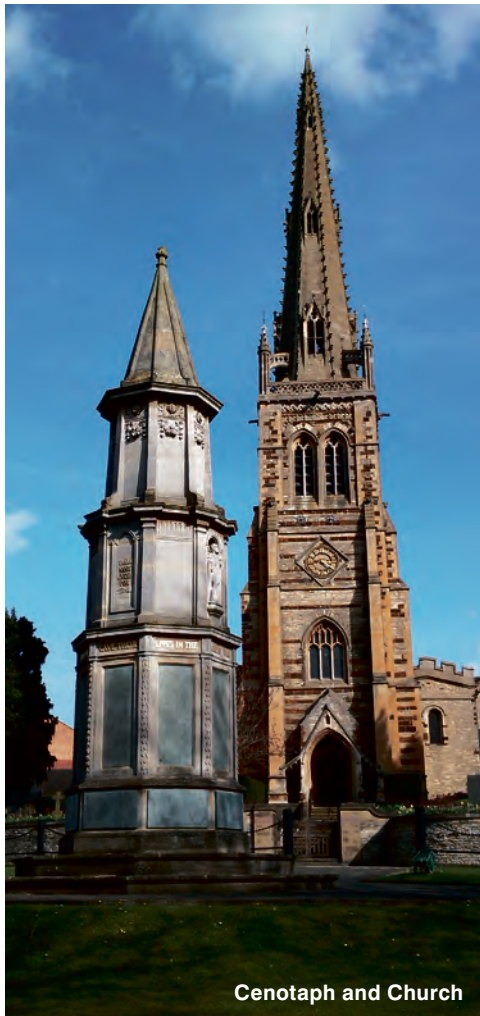
Cenotaph and Church

Rushden is the largest town in East Northamptonshire with a population of 30,000 people. The town has a wealth of history dating back thousands of years with indications of there being Bronze and Iron Age settlements in the area as well as Roman sites found nearby.