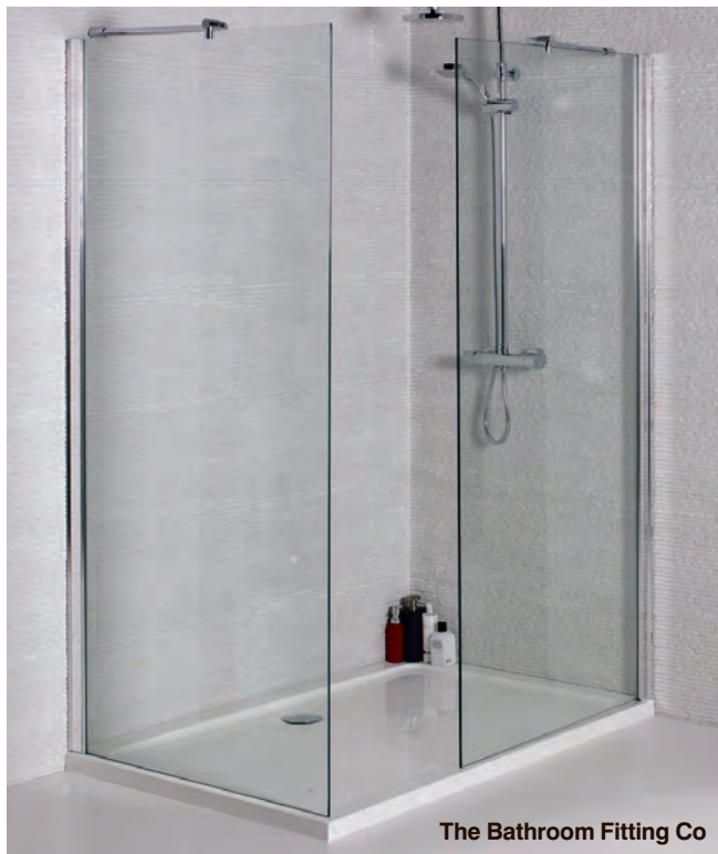
The Bathroom Fitting Co

Need tracks or poles to go with your new curtains? We have a wonderful collection of wood poles, either natural looking or