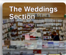
The Weddings Section