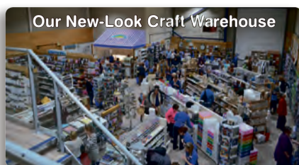
Our New-Look Craft Warehouse