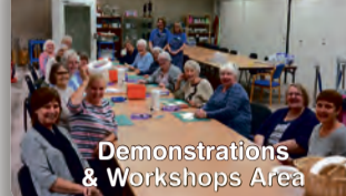
Demonstrations & Workshops Area

At Rushden, Northants our 6,500 sq. foot warehouse has 1000's of craft, haberdashery & hobby supplies - all at great prices! Also, we now OPEN 7 DAYS A WEEK.