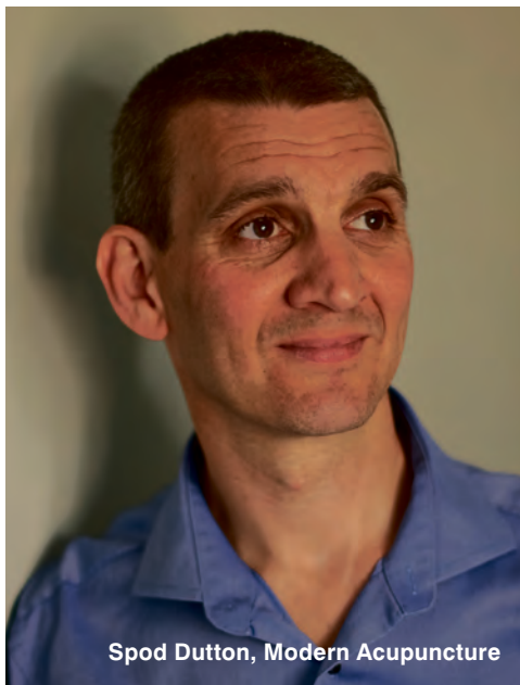
Spod Dutton, Modern Acupuncture

"So, next time your eye examination is due, think about supporting your local family optician and see what a difference we can make for you."