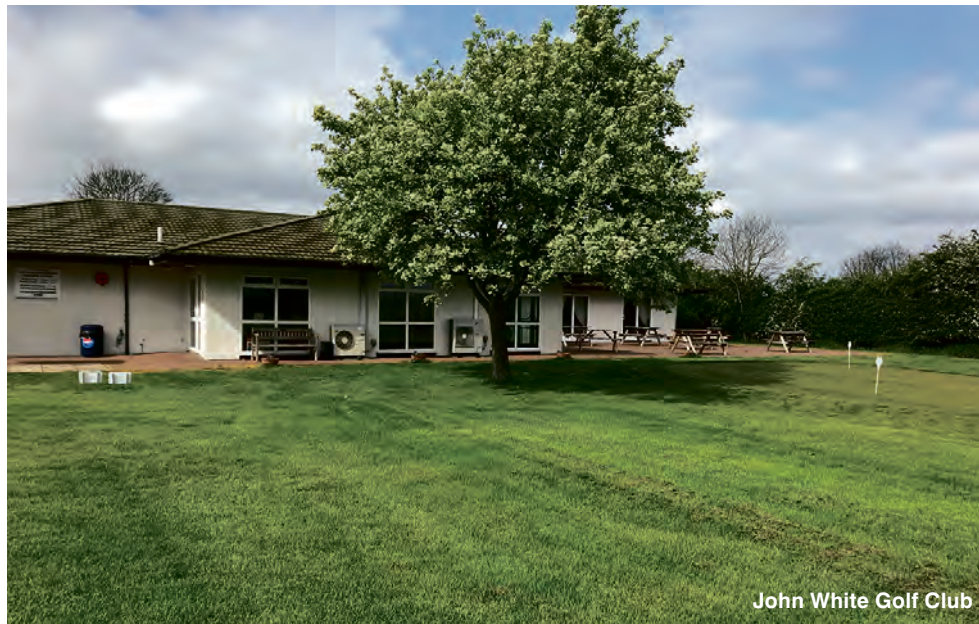
John White Golf Club