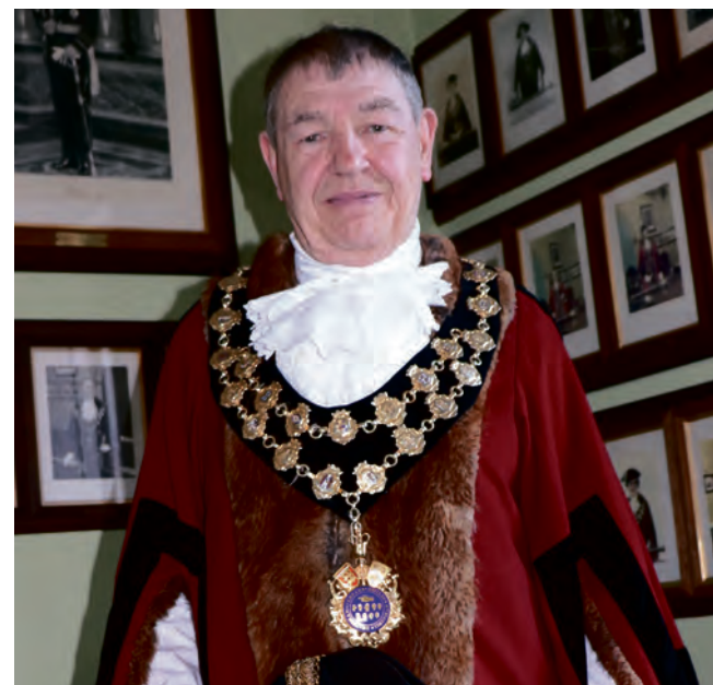
To contact the Mayor for more information on any events or Council business email mayorhftc19@gmail.com or contact the Town Hall on info@highamferrers-tc.gov.uk

events in the town and my own fundraising events. I shall be there to talk to people about any ideas or even concerns they have. I would also like to encourage you to come to Council meetings, as I'm not so sure that everyone realises that they are able to attend."