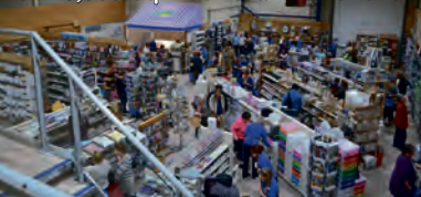
Our 6,500 Sq. Foot Craft Warehouse

In addition to half-price Christmas themed products we will have other clearance lines & will be offering a fabulous 30% off all non-sale items & 20% off all books. Be there!