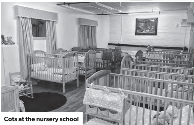
Cots at the nursery school

The nursery, which caters for babies and children aged up to 14, normally opens from 7am to 7pm, however it has now made available cots, beds and washing facilities for children to stay overnight.