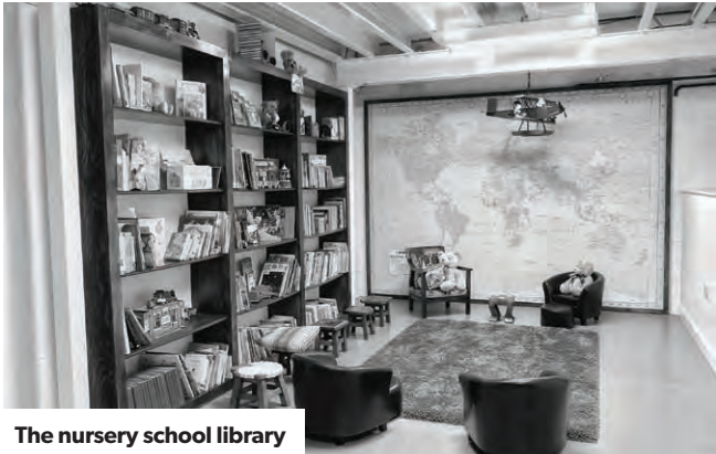
The nursery school library

Omnipresence Nursery School in Freehold Street, Northampton is offering key workers a helping hand by extending their hours and opening 24 hours a day to provide round-the-clock childcare.