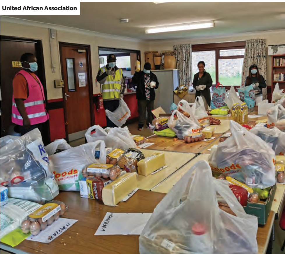
United African Association