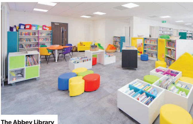
The Abbey Library

Further information will be available on the website as matters progress.