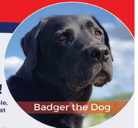
Badger the Dog

Book a FREE 20 minute consultation if you're not sure whether we can help.