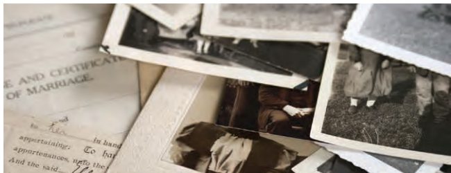
Genealogy Specialists, Tracing Our Past, Discovering Our Genes (TOP DOG) www.genealogy-specialists.com

Local schools are also very helpful and take an interest in their history as many were around back in the 19th century, albeit not necessarily on their present sites. Always worth contacting.