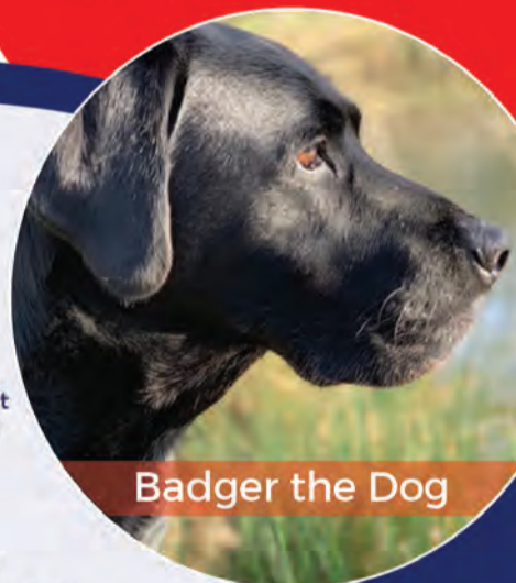
Badger the Dog

www.ashgrovehealth.co.uk 13 Lancaster Street, Higham Ferrers, Rushden, Northamptonshire, NN10 8HY