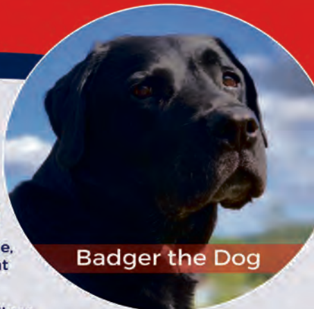
Badger the Dog

Book online with our simple system, or call us on 01933 328020.