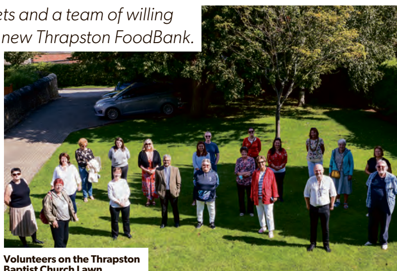
Volunteers on the Thrapston Baptist Church Lawn

Operating under the umbrella of East Northants Community Services (ENCS), Thrapston FoodBank is able to share resources, systems and operating procedures with Raunds and Rushden food banks, who are also part of ENCS. This meant it could get up and running