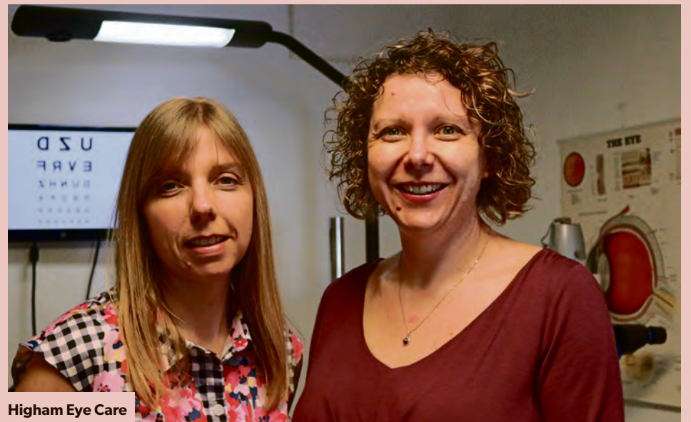
Higham Eye Care

The new autumn ranges at Higham Eye Care bring a touch of much needed colour to 2020.