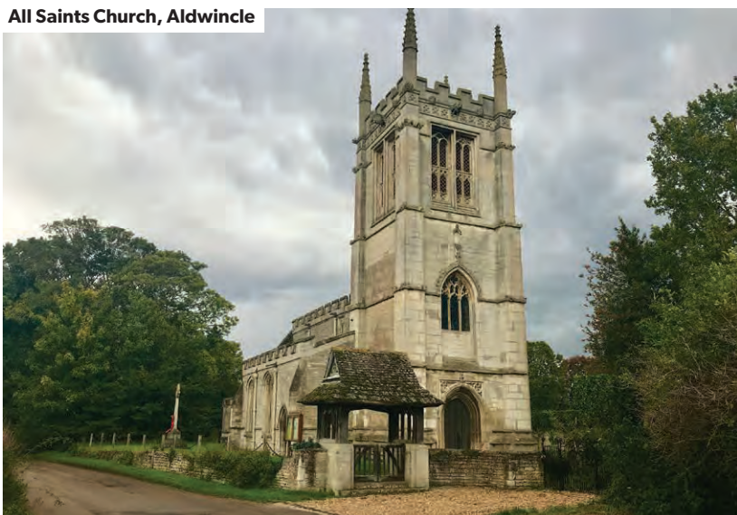
All Saints Church, Aldwinckle

SHOWROOMS: 69-71 WASHBROOK RD • RUSHDEN • NORTHANTS NN10 6UR action2mobility.co.uk