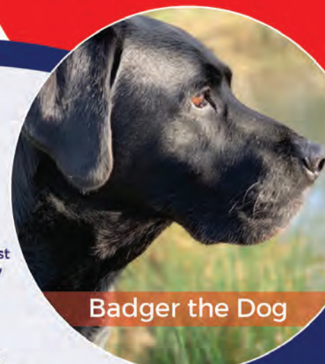
Badger the Dog

Book a FREE 20 minute consultation if you're not sure whether we can help.