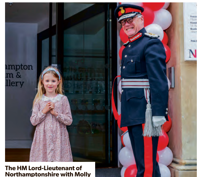
The HM Lord-Lieutenant of Northamptonshire with Molly

The museum and all exhibitions are free, with the building open from 10am-5pm Tuesdays through to Saturdays and from 12-5pm on Sundays.