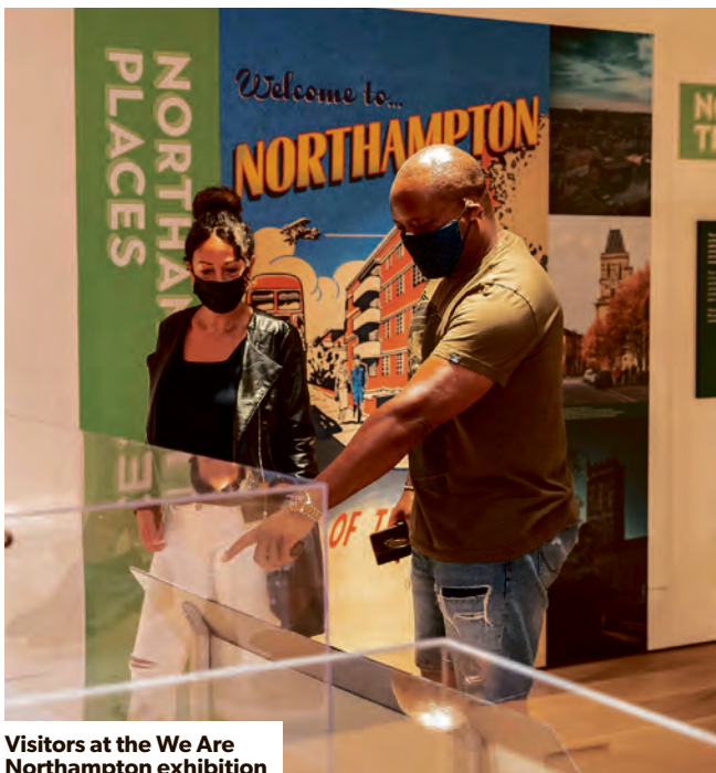
Visitors at the We Are Northampton exhibition

The museum in Guildhall Road opened its doors to the public at 10am, following an extensive £6.7 million expansion and redevelopment programme, which began in 2017 and has seen the building double in size, with the addition of a nine-metre-high glazed atrium extension linking the original building to brand new galleries and activity space.