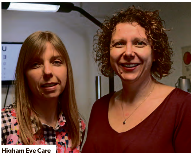
Higham Eye Care

To take advantage of the free 20-minute consultation offer call the clinic on 01933 469043 or email reception@ashgrovehealth.co.uk