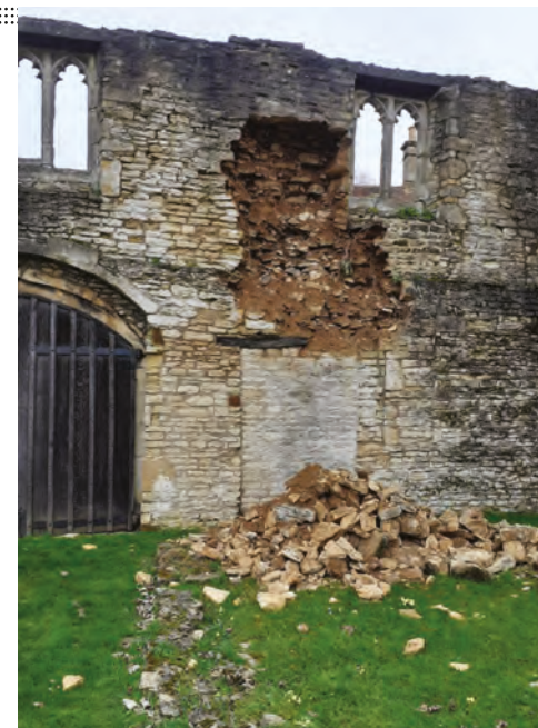
The collapse of the Chichele College stonework marked the first time the wall had fallen down in 600 years

"You are all very lucky to live in such a lovely, historic town," he added.