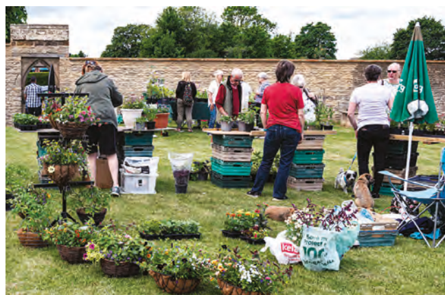
The Higham Ferrers Tourism Committee's Chichele Garden Fair proved a popular outing for locals and out-of-towners alike