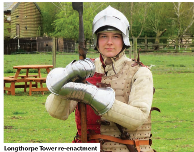
Longthorpe Tower re-enactment

The team at Nene Park Trust are hoping this weekend will be the first of many similar re-enactment weekends hosted at Longthorpe Tower, bringing its colourful medieval history to life and inspiring visitors to find out more. Keep your eyes out for future living history weekend dates.