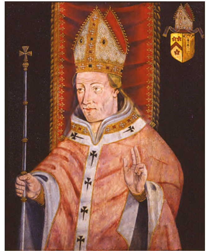
Higham Ferrers-born Henry Chichele, the town’s most famous son, whose vision and legacy have just been celebrated

A Summer Party complete with more music, which was open to the public, followed and the next day Higham Ferrers Tourism staged their popular Brass On The Grass event in St Mary’s Churchyard.