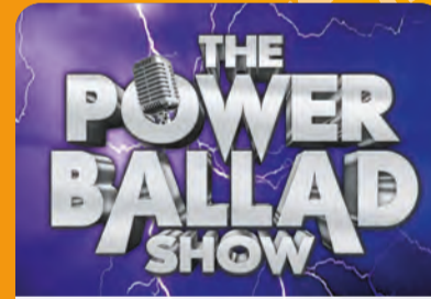
The Power Ballad Show Thu 6 October 7.30pm