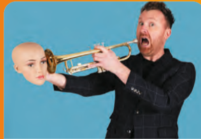
Jason Byrne: Unblocked Sat 24 September 7.30pm