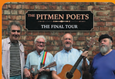
The Pitmen Poets Thu 20 October 7.30pm