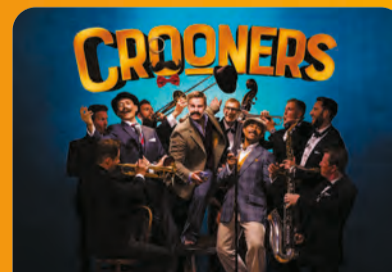
Crooners Fri 21 October 7.30pm

Tickets 01536 470 470 www.thecorecorby.com