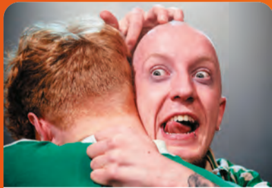
Trainspotting Live Tue 6 - Sat 10 September

To see the full range of great shows now on sale, pop in and pick up a brochure or visit our website at www.thecorecorby.com