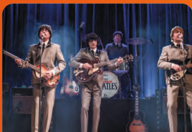
The Cavern Beatles Fri 7 October 7.30pm