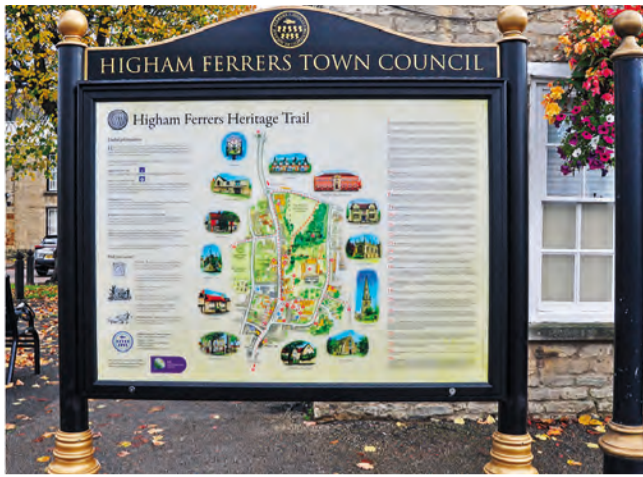
The colourful depiction of the Higham Ferrers Heritage Trail on the reverse of the board is also attracting the attention of passers-by.