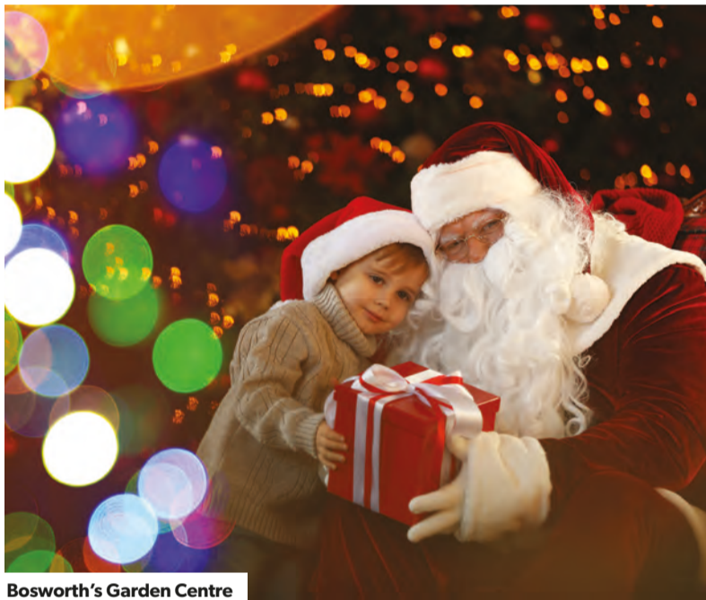
Bosworth's Garden Centre

Make this a Christmas to remember with Bosworth's.