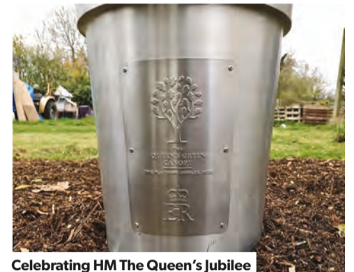
Celebrating HM The Queen's Jubilee