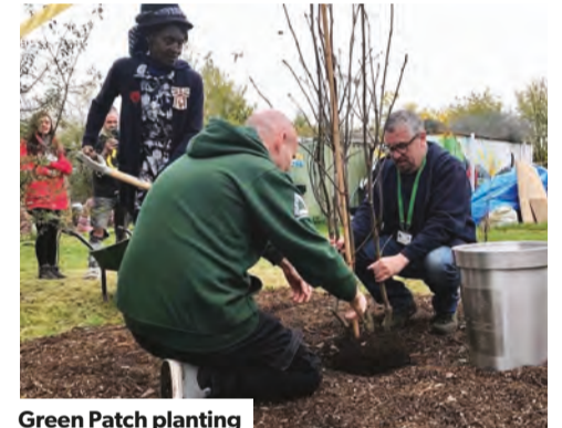
Green Patch planting