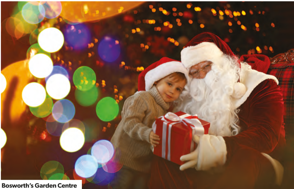
Bosworth's Garden Centre

Make this a Christmas to remember with Bosworth's.