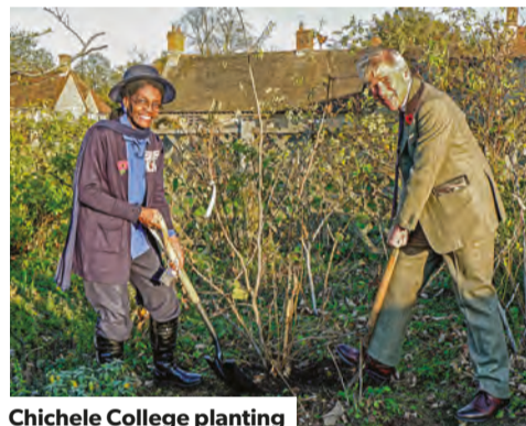
Chichele College planting