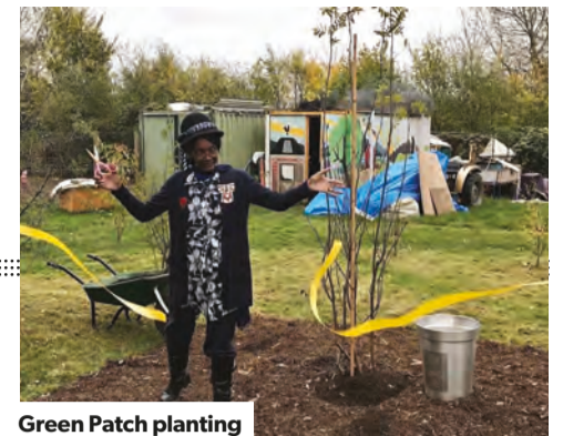
Green Patch planting