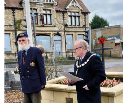
Rushden Town Mayor, Cllr Adrian Winkle