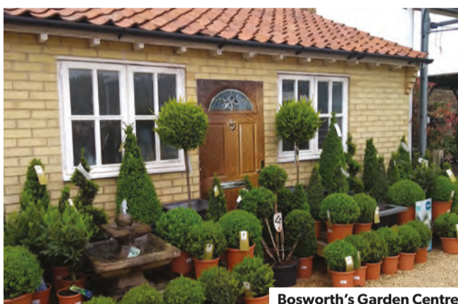
Bosworth's Garden Centre