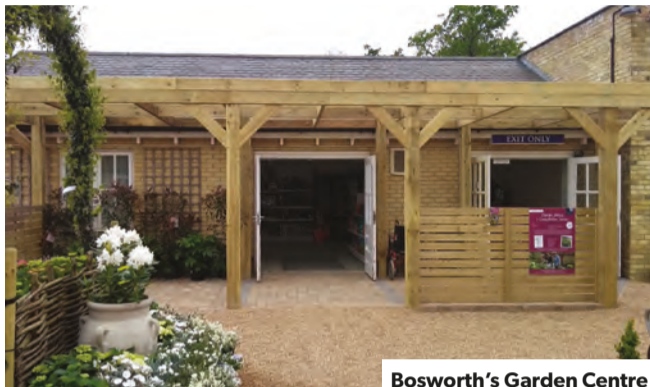
Bosworth's Garden Centre

"Our restaurants are now fully open. Don't forget we are at Burton Latimer too!"