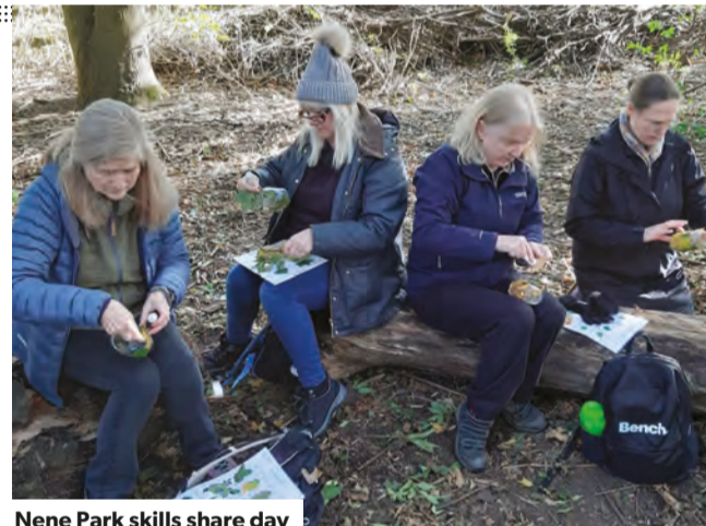
Nene Park skills share day

The course involves eight days of face-to-face training onsite at Ferry Meadows in Peterborough, including theory and practical sessions in a dedicated Forest