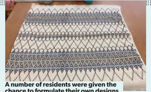
A number of residents were given the chance to formulate their own designs

Such was his passion for the craft, that residents at Richmond Villages Northampton