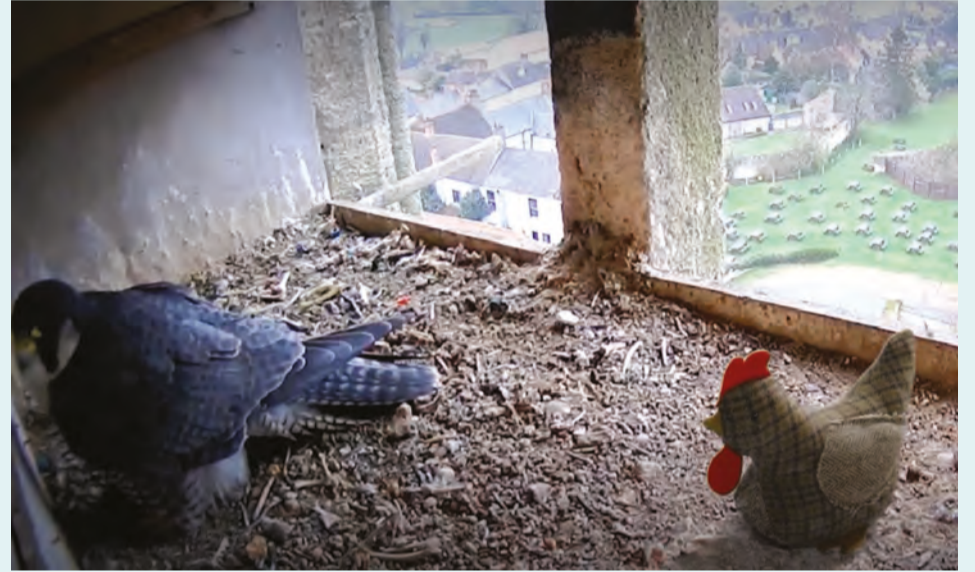
If you've not seen the livestream yet, you can find it at www.ashgrovehealth.co.uk/falcons . Currently there are 4 eggs.

The chicken was filmed sitting on a green screen carpet, with a fan on it to create a bit of movement in the toy. The clip was then run over the top of the livestream. A video of how it was done will be up on the website.