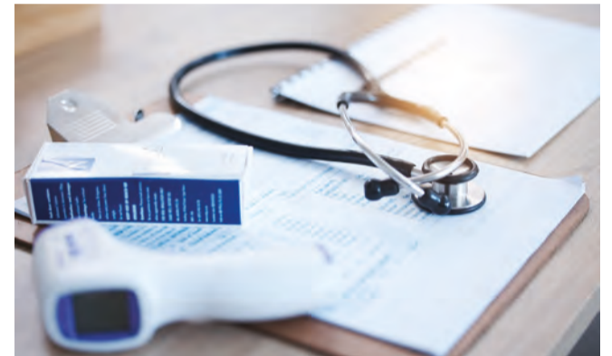
For more information on when to call 999 and when to go to A&E, you can visit the NHS UK website.

Patients should continue to call 999 in a medical or mental health emergency – when someone is seriously ill or injured, or their life is at risk.