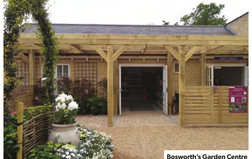
Bosworth's Garden Centre

"Plants are what we are all about and you can be sure to find a well