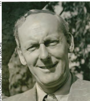
Herbert Ernest (H.E.) Bates, CBE

His grandfather also had a big influence on his life. When H.E. was born, he became the son