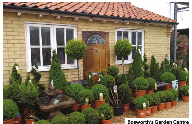
Bosworth's Garden Centre