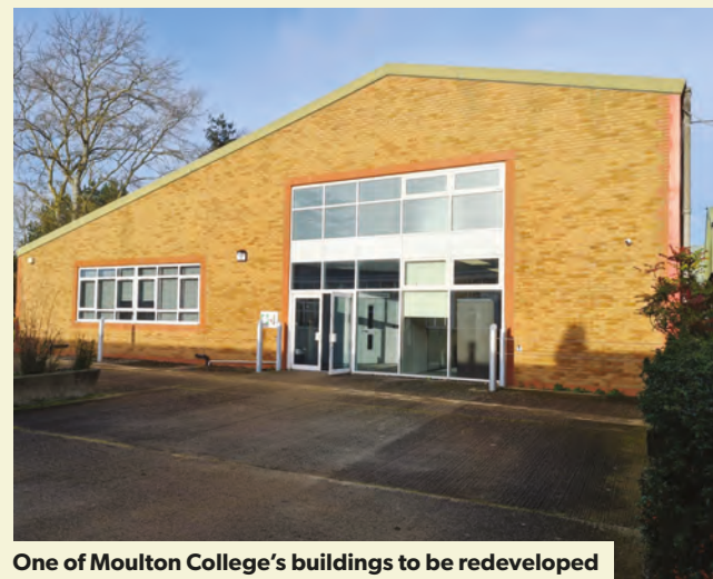
One of Moulton College's buildings to be redeveloped

Minister for Skills, Apprenticeship and Higher Education Robert Halfon says: "This boost of over £100 million is our latest investment in T Levels. These are robust, high quality technical qualifications providing a unique ladder of opportunity for students to gain both classroom