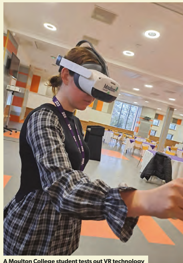
A Moulton College student tests out VR technology