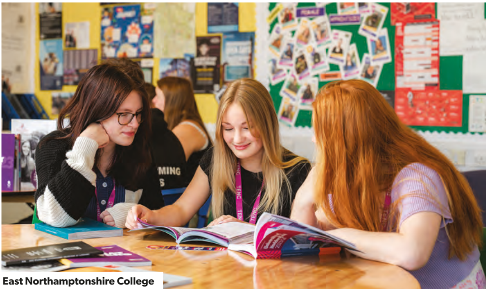
East Northamptonshire College

The East Northamptonshire College combines knowledge, expertise and resources from Rushden and Huxlow Academies (both part of the TOVE Learning Trust) into one Sixth Form Partnership.