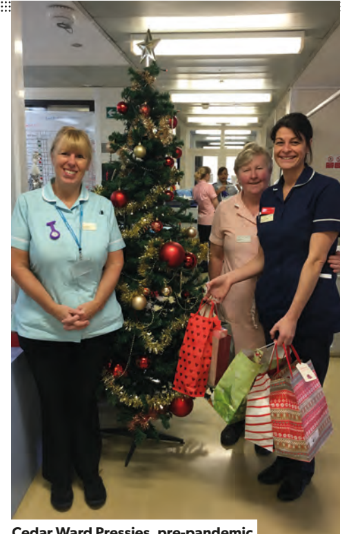
Cedar Ward Pressies, pre-pandemic

With your support, Northamptonshire Health Charity aims to ensure that EVERY patient in local NHS hospitals across the county receives a present on Christmas Day. For any enquiries, please reach out to the charity team by emailing greenheart@nhcf.co.uk or calling the Northampton office on 01604 626927.