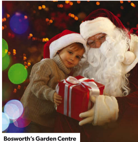
Bosworth's Garden Centre