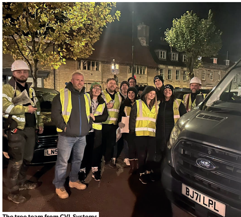
The tree team from CVL Systems

The tourism committee's next event will be the Christmas Celebration Coffee Morning on Saturday 23rd December in the Bede House (adjacent to St Mary's Church) between 10am and 12 noon.