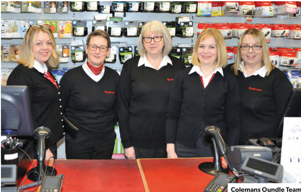
Colemans Oundle Team