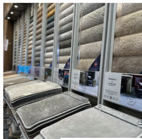
Oundle Carpets & Flooring

Oundle Carpets and Flooring, Unit 4-6, Eastwood Rd, Oundle, Peterborough PE8 4DF. Tel: 01832 275009, Email: sales@oundlecarpets.com , or visit the website at www.oundlecarpets.co.uk