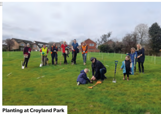
Planting at Croyland Park

"As we reach the end of the tree planting season, I would like to take this opportunity to thank all of the council officers who have worked hard across the season as well as the dedicated volunteer groups