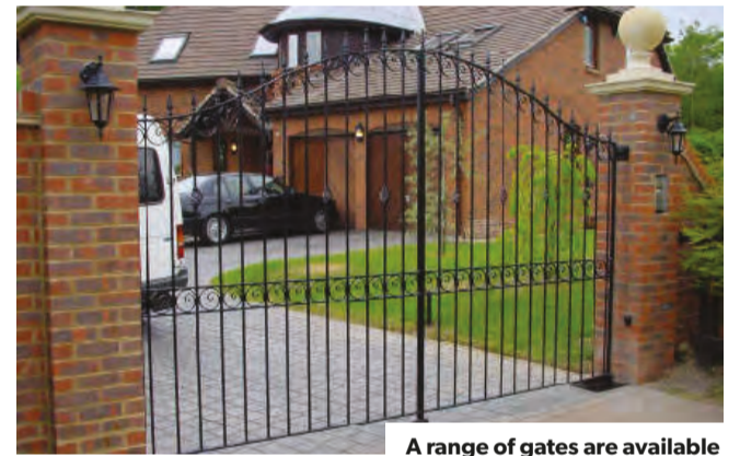
A range of gates are available