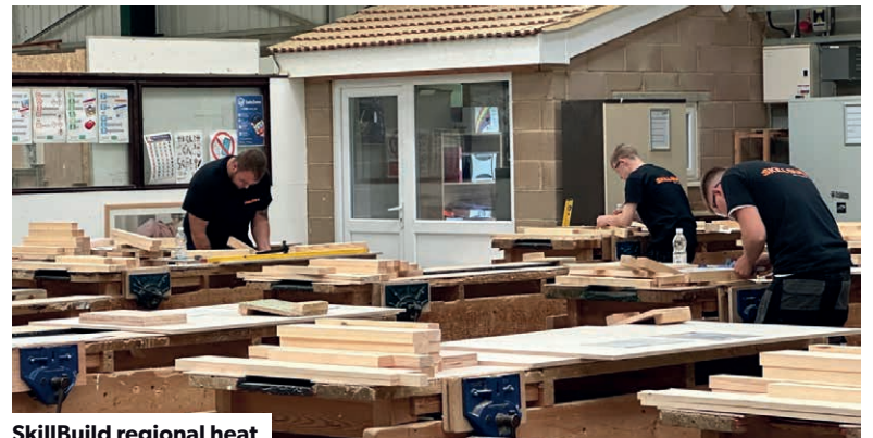
SkillBuild regional heat

"SkillBuild is a fantastic opportunity for young people to develop their technical skills and showcase their craft, grow their confidence and advance their career options for future employability. It's exciting for all of us to witness the magic that happens when passion meets talent, and we can't wait to see the winners crowned at the SkillBuild National Final later this year."