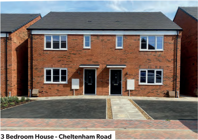
3 Bedroom House - Cheltenham Road

Armed Forces play such a vital role in communities, so it's important that we help and support them in any way we can, that includes being innovative and thinking outside the box. The development at Cheltenham Road is the first of its kind in the area and I am sure it will make such a difference. We look forward to meeting the residents once everyone is settled in." More information about NNC's commitment to the Armed Forces Covenant and the Cheltenham Road site is available on the council's website.