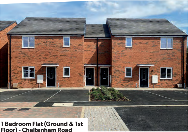
1 Bedroom Flat (Ground & 1st Floor) - Cheltenham Road