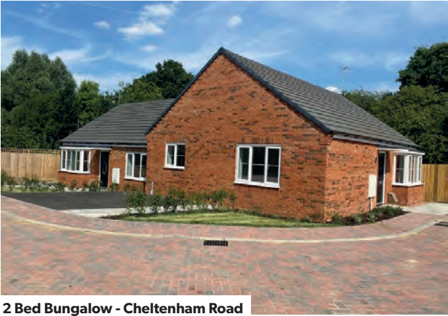
2 Bed Bungalow - Cheltenham Road