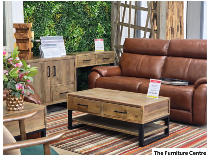
The Furniture Centre

Feel welcome to call the team or visit the showroom today.