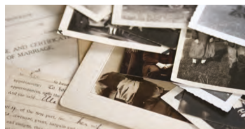
Genealogy Specialists, Tracing Our Past, Discovering Our Genes (TOP DOG) www.genealogy-specialists.com

Direct questions are useful for establishing facts such as "What was your Grandmother's name?" but also use plenty of open questions such as "What do you remember about...?" for most of the time, as that way you can unearth a wealth of memories. If you have an unobtrusive recorder, with the relative's permission, it would be an ideal way of making sure that you do not miss anything and make the time spent seem more like a chat than an interview.