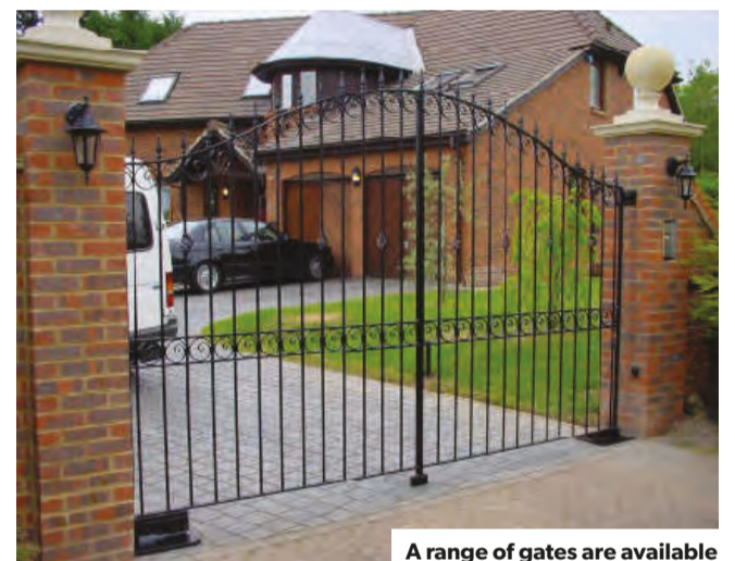
A range of gates are available