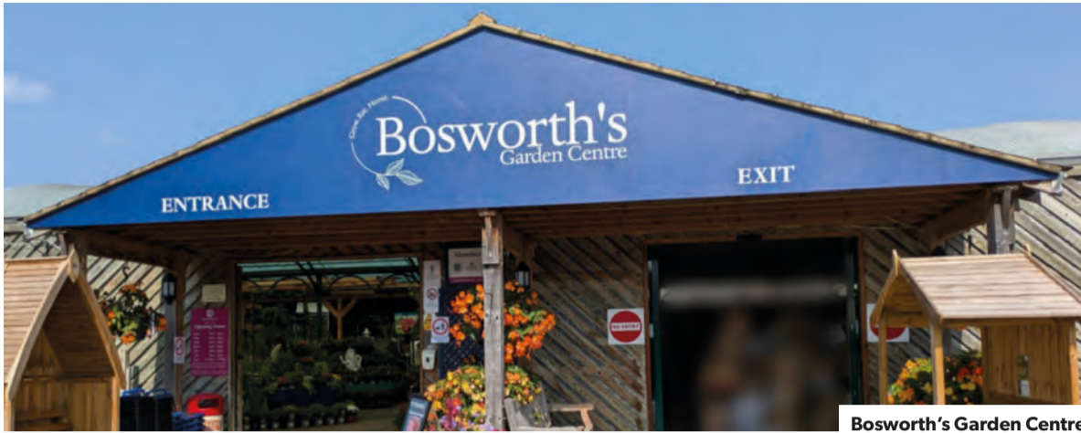
Bosworth's Garden Centre

of products and services for every season and occasion.