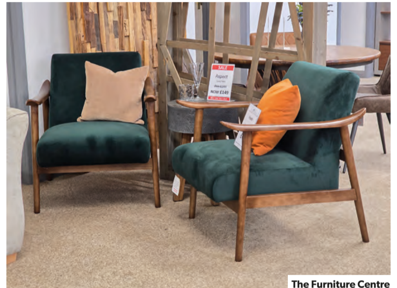
The Furniture Centre