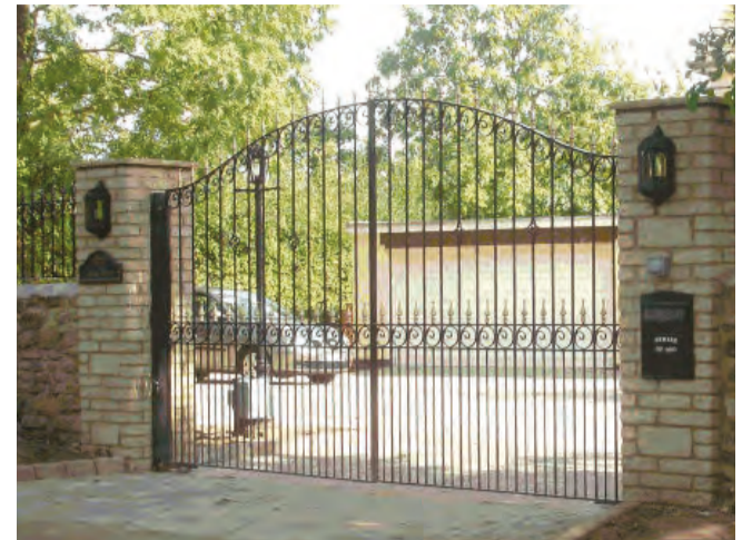
Regent Street Wrought Iron Works