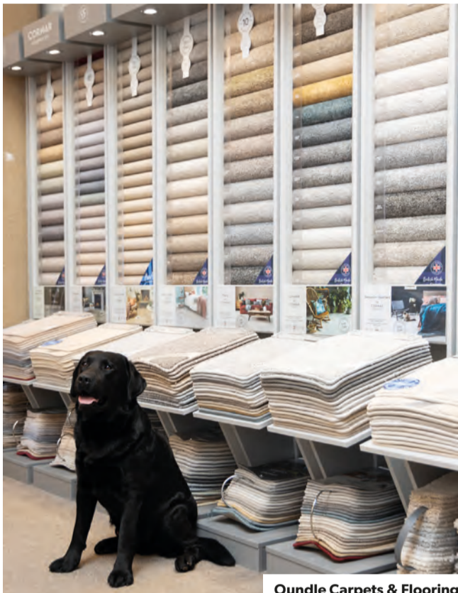
Oundle Carpets & Flooring

Additionally there is now a range of estate gates, which are designed for either manual or automatic operation, and are matched by complementary fencing or walling.