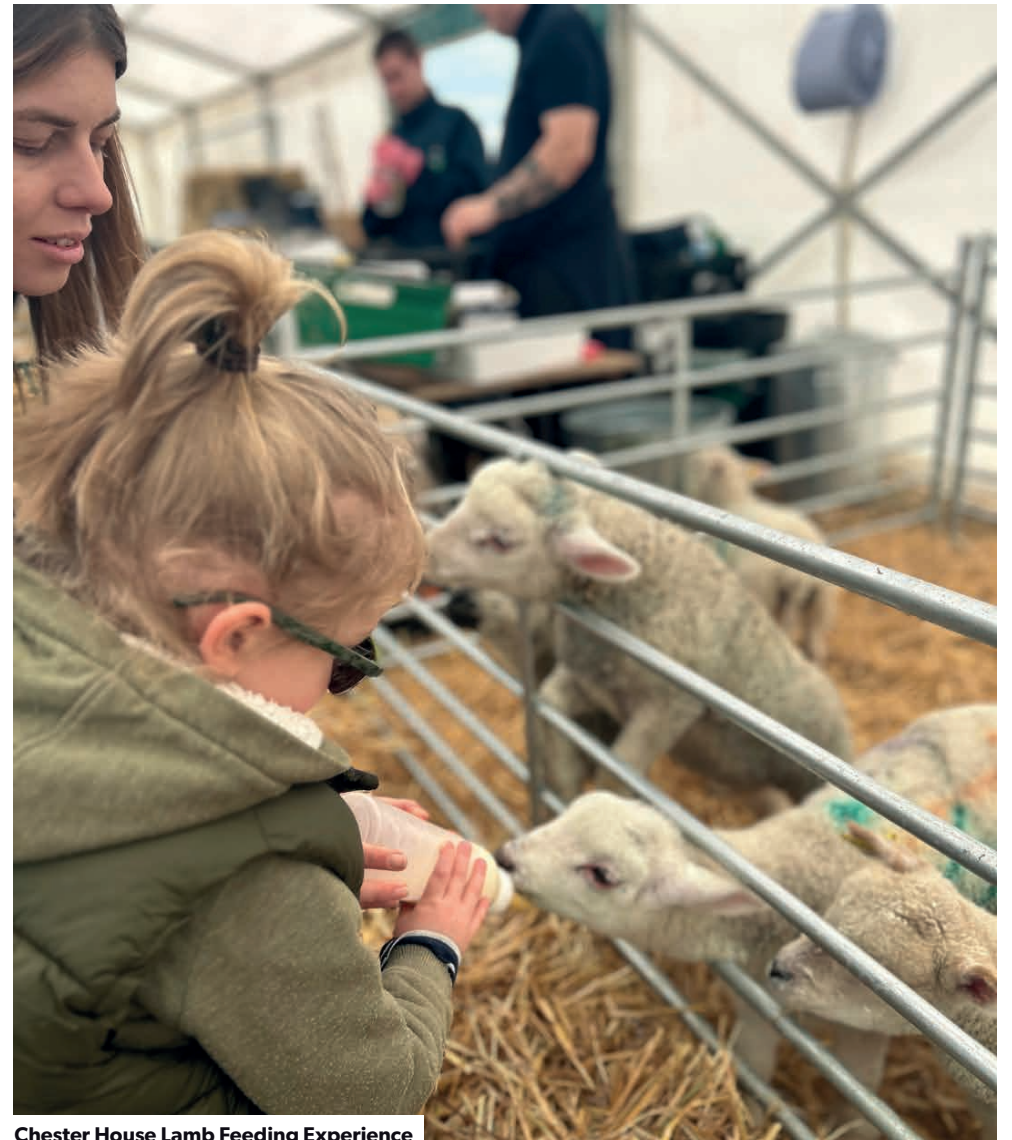
Chester House Lamb Feeding Experience

Find out more about The Great Spring Adventure on the Estate's website: chesterhouseestate.org/whats-on/the-great-spring-adventure/