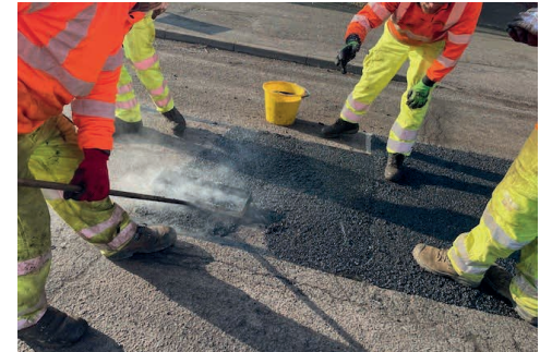
Highways team at work

"Seeing the Roadmender in action with the Highways team was eye-opening – it speeds up repairs, reduces disruption, and ensures a longer-lasting fix. We're taking a proactive