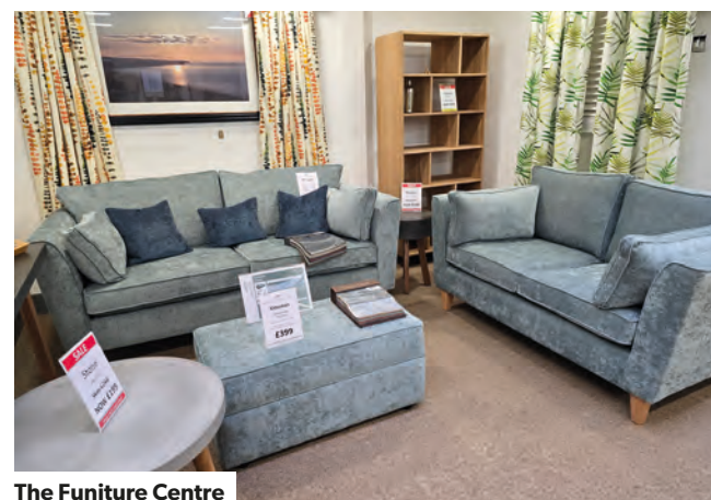
The Furniture Centre