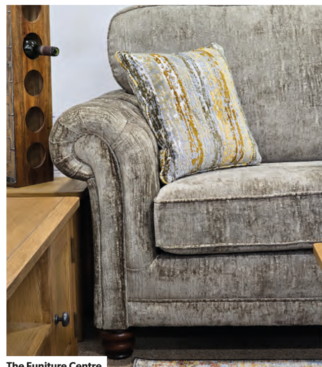
The Furniture Centre

"At the Furniture Centre, we have been designing, building and delivering high quality furniture for over 15 years. From our base in Northamptonshire, we are proud to create and supply both traditional and contemporary styles of upholstery, living, dining and