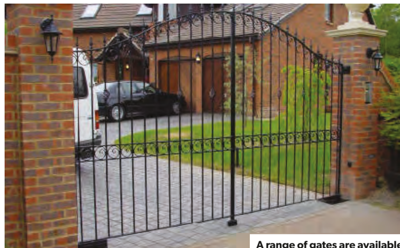
A range of gates are available

"As we think that customer security is important, we fit (free of charge)