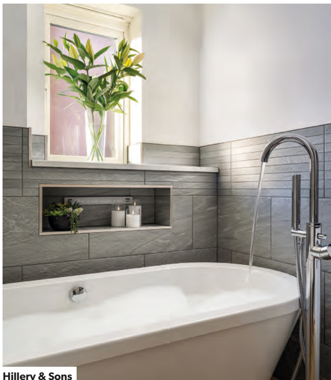
Hillery &amp; Sons

Kettering or we can visit you for a no obligation design discussion and quote. To see our work visit: www.mjhillery.com or call 01536 791914 or 01604 411788."