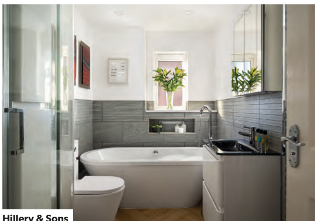
Hillery &amp; Sons