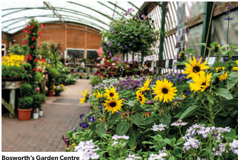
Bosworth's Garden Centre