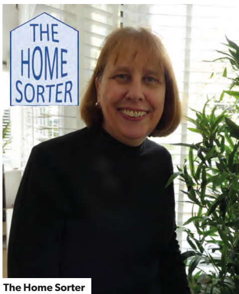
The Home Sorter

"I'm a member of the Association of Professional Declutterers and Organisers (APDO), so I'm bound by their code of ethics, and am fully insured. APDO is a not-for-profit association that provides membership to professional organisers and is the UK's association for the decluttering and organising industry."