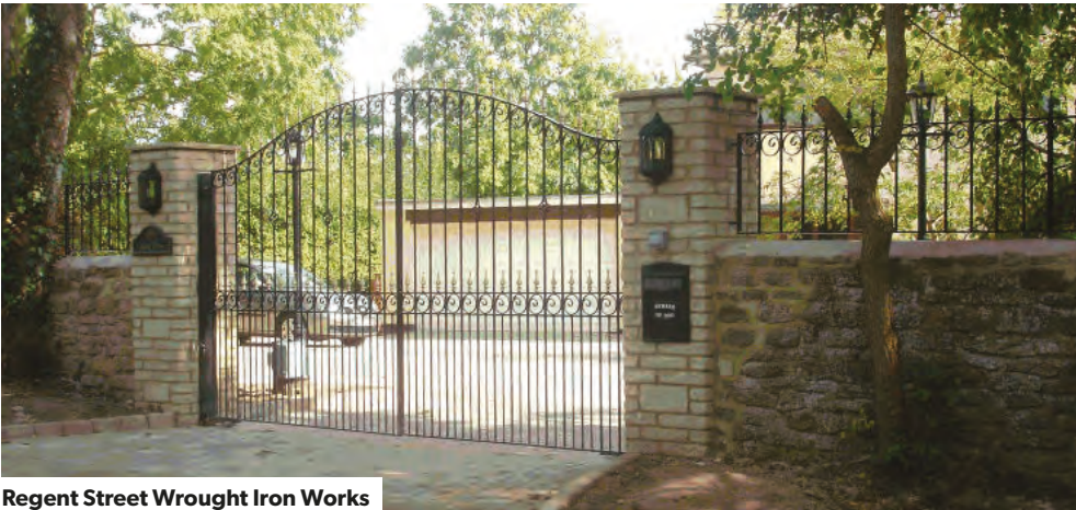
Regent Street Wrought Iron Works

locking bolts to our side-entry gates and a lockdown bolt to our double gates. We will also discuss any other security arrangements a customer may feel are necessary.