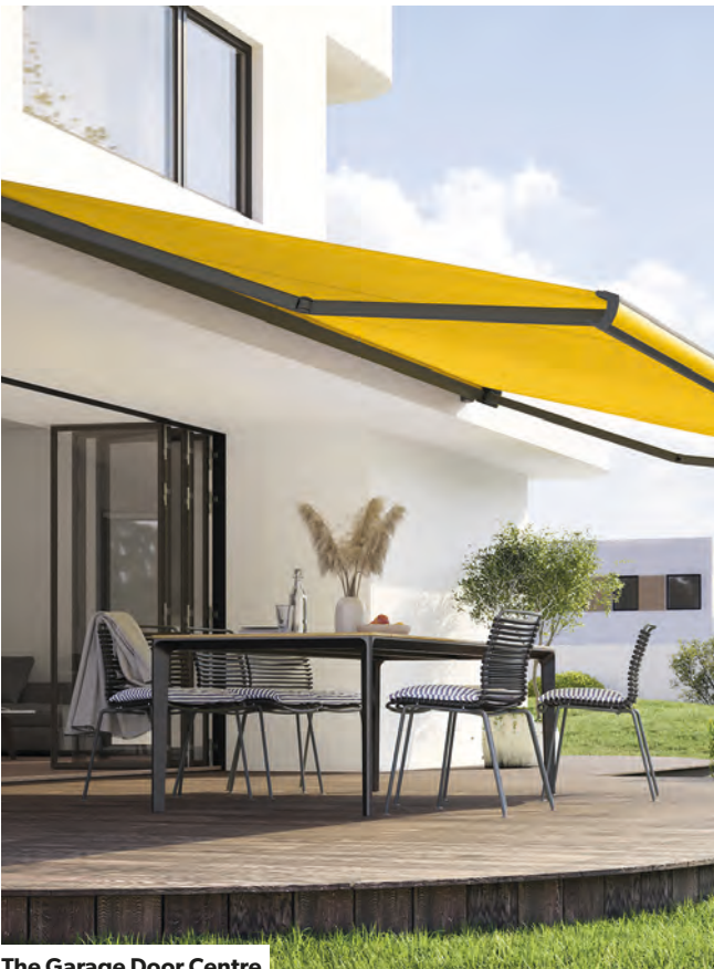
The Garage Door Centre

"With over 40 years of experience and with accredited electricians and plumbers, Hillery & Sons not only design beautiful bathrooms, but we install them too. Visit our showroom at 48 High Street,